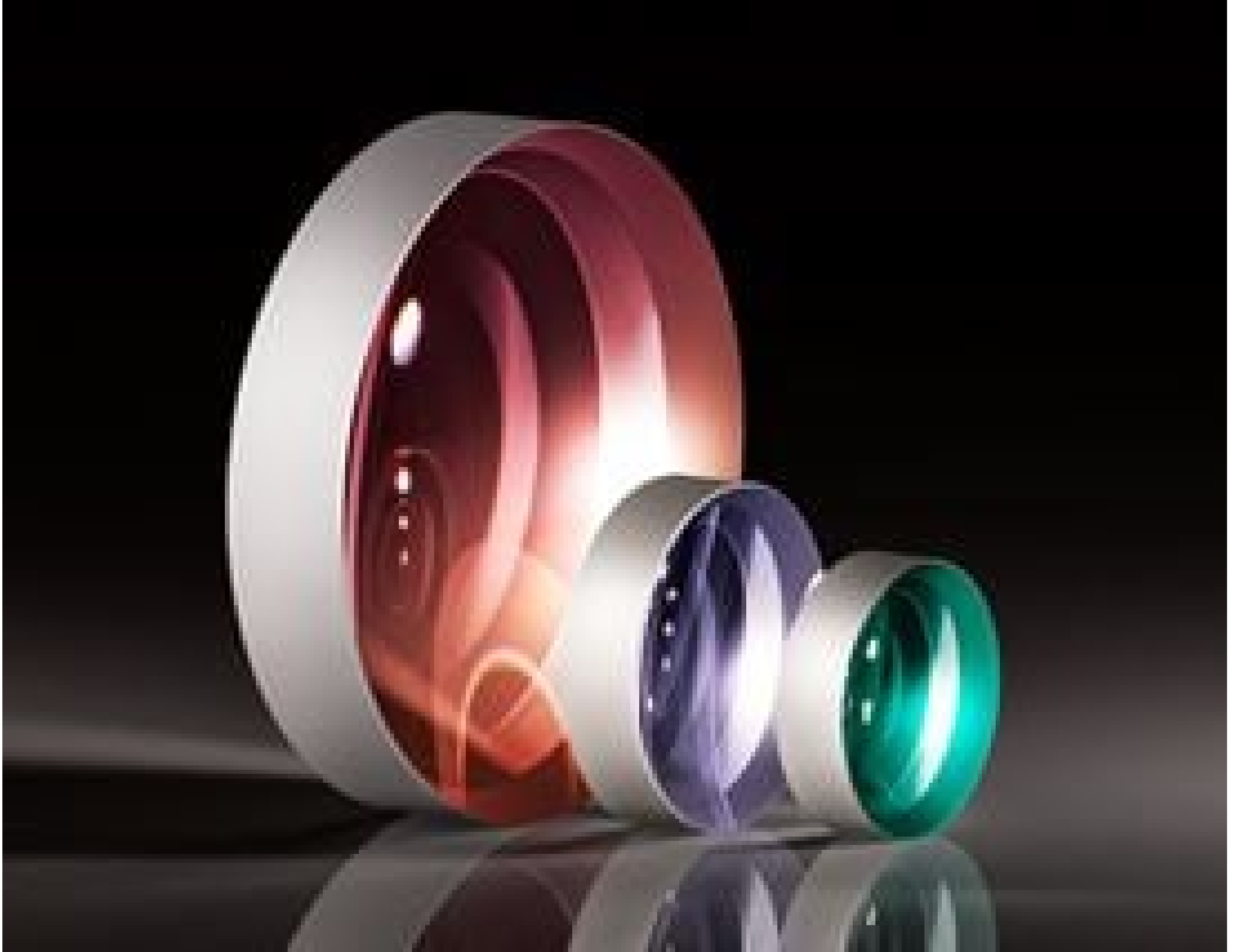
TECHSPEC Uncoated Plano-Concave (PCV) Lenses