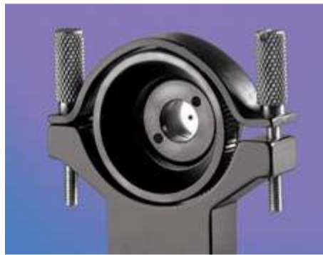
Precision Pinhole Mount