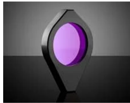
Compact Mirror & Lens Mounts