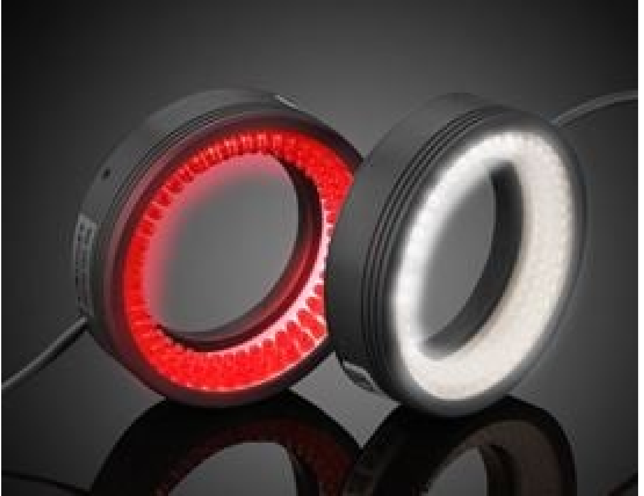
CCS Low-Angle LED Ring Lights