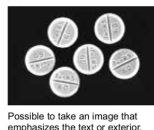
Possible to take an image that emphasizes the text or exterior.