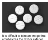
It is difficult to take an image that emphasizes the text or exterior.