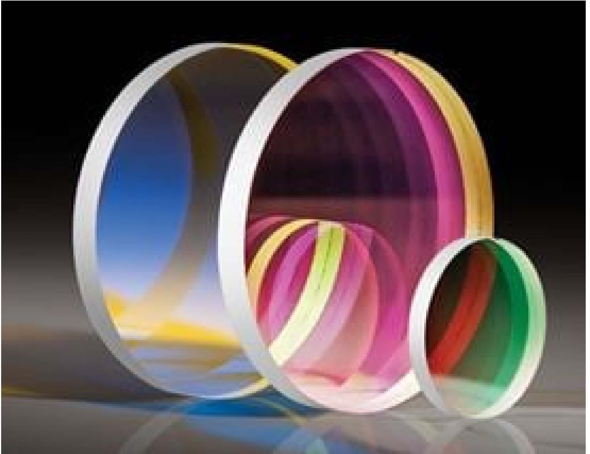
High Performance OD 4.0 Longpass Filters