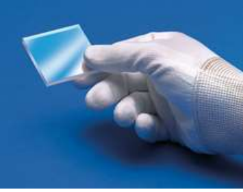
Component Handling Tools

These optics require special handling to avoid damage and ensure long-term performance. Proper handling, cleaning, and storage are essential to maintain optical quality. Explore our Optics Cleaning Resources for step-by-step guides and best practices. For personalized assistance, Email us or Chat with our technical support team.