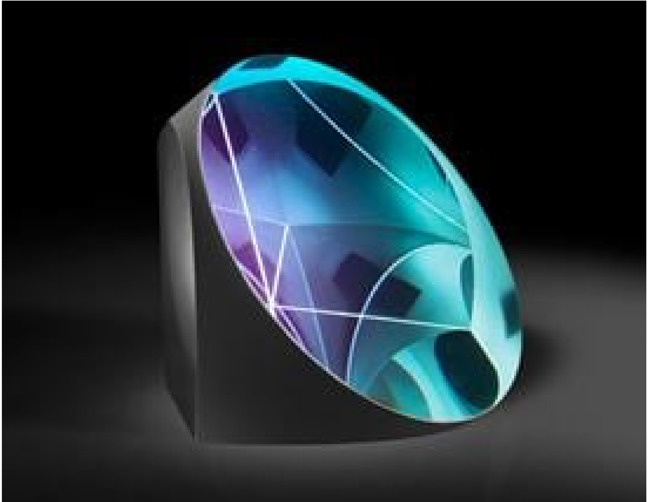
N-BK7 Corner Cube Retroreflectors with Black Overpaint