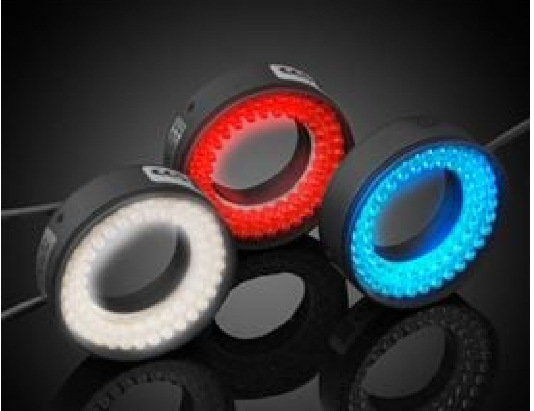
CCS High-Angle LED Ring Lights