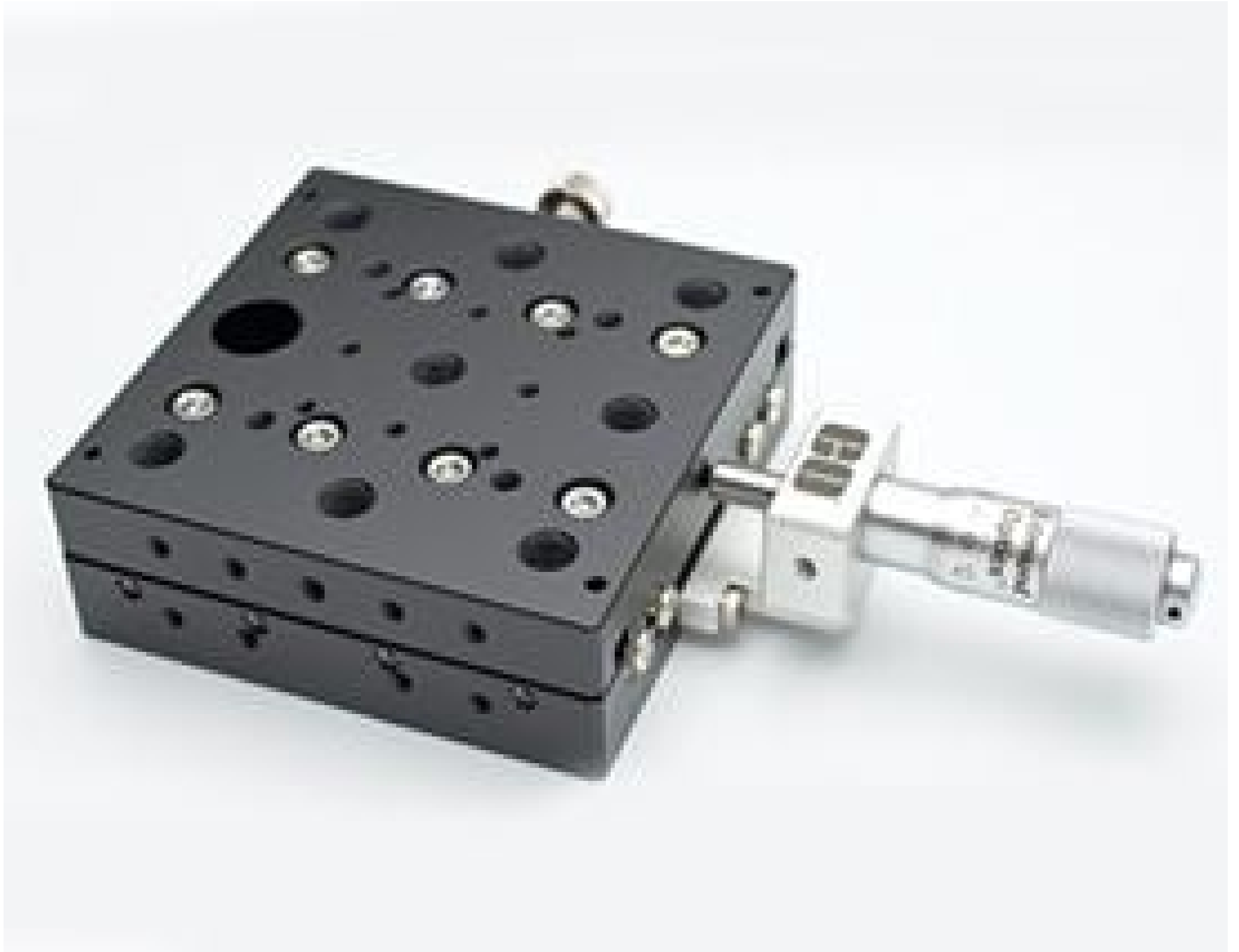
#66-427 - 70mm, 0.5" Travel, Micrometer Drive Stage (Center Drive)