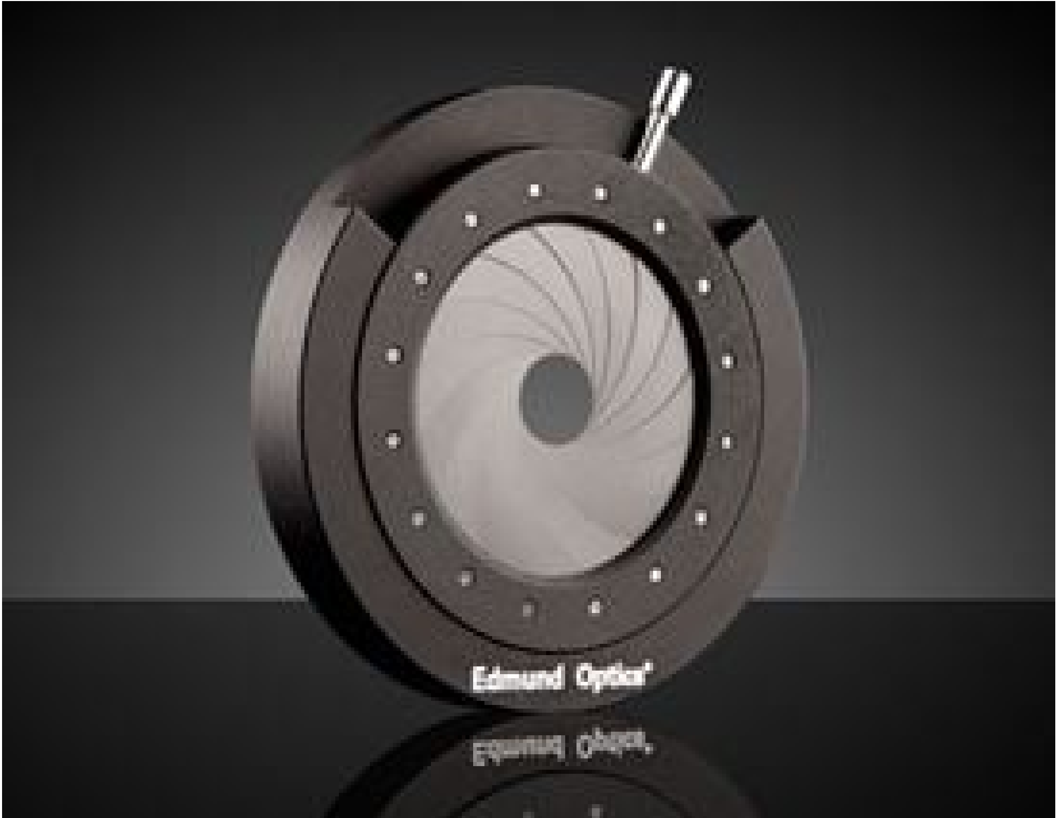
66mm Outer Diameter, Mounted Iris Diaphragm, #53-916