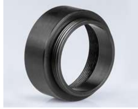
#55-743 - C-Mount Male to Mitutoyo (M26) Female Step-Up Adapter £41.60