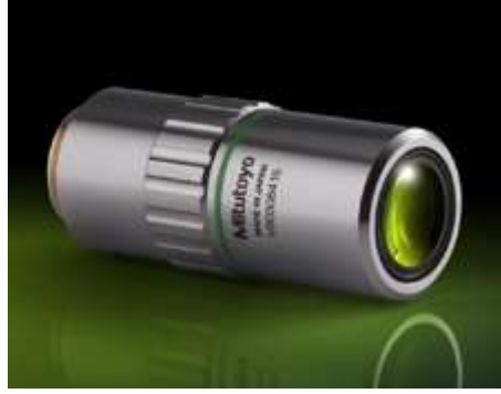
#46-145 - 20X Mitutoyo Plan Apo Infinity Corrected Long WD Objective £2,152.00