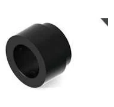
#18-291 - E-Series 19.1mm ID Adapter £19.20