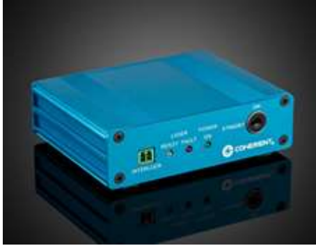
#86-878 - Coherent® 1263030 | Laser Controller with CDRH Key Lock + Power Supply £416.00