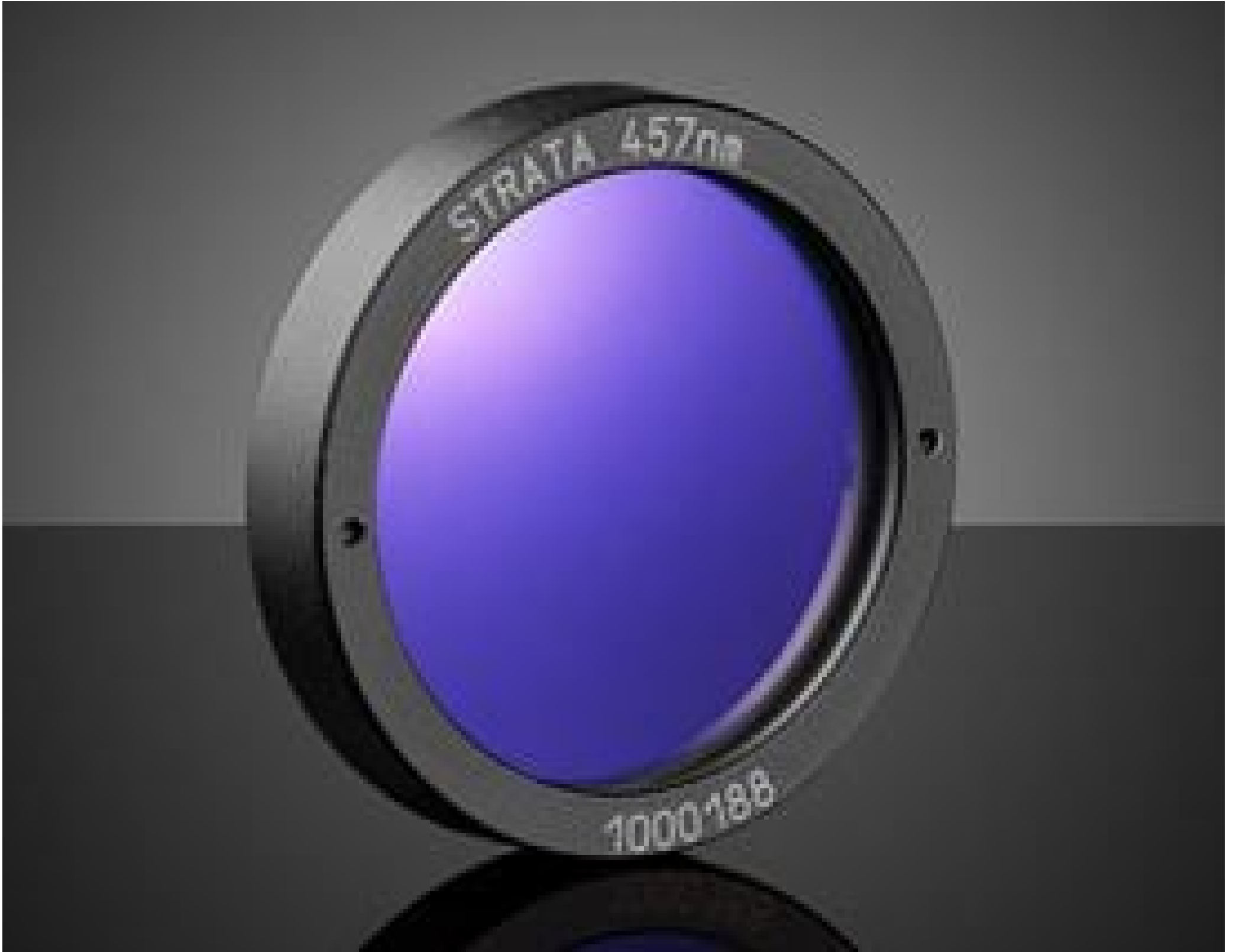
25.4mm META® holoOPTIX® STRATA Notch Filter