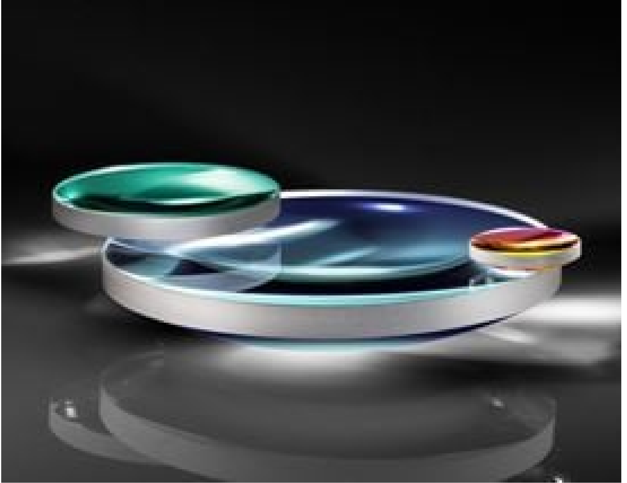
633nm Laser Line Coated Plano-Convex (PCX) Lenses