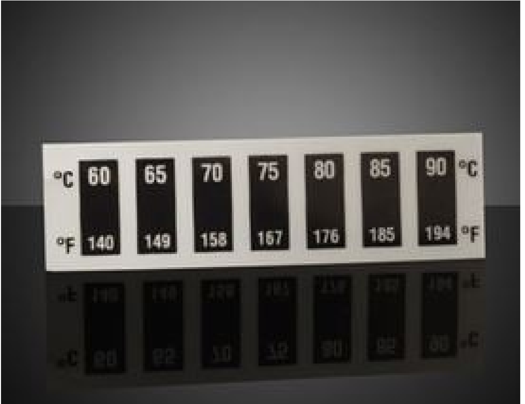
60 - 90°C Temp Range, Liquid Crystal Thermometers (10/Pack)