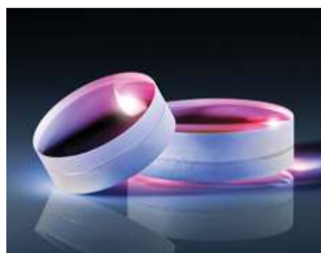
#32-303 - 6.25mm Dia. x 20mm FL, MgF 2 Coated, Achromatic Doublet Lens £56.80