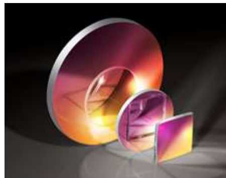
4-6 \lambda First Surface Mirrors