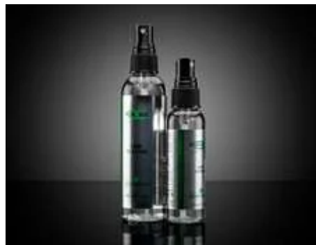
PUROSOL™ Optical Cleaner