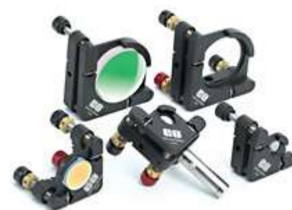
Optical Mirror Mounts