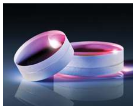
#32-315 - 12.5mm Dia. x 40mm FL, MgF 2 Coated, Achromatic Doublet Lens £68.80