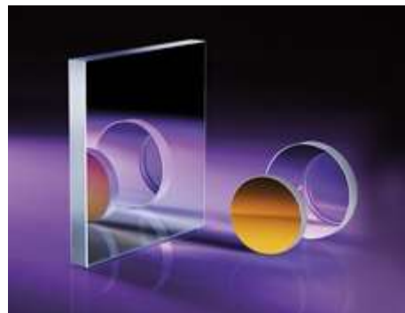
\lambda/4 First Surface Mirrors