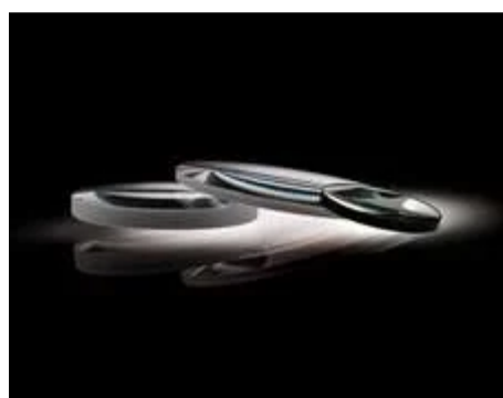
#31-861 - 6mm Dia. x 9mm FL, MgF 2 Coated, Double-Convex Lens £31.80