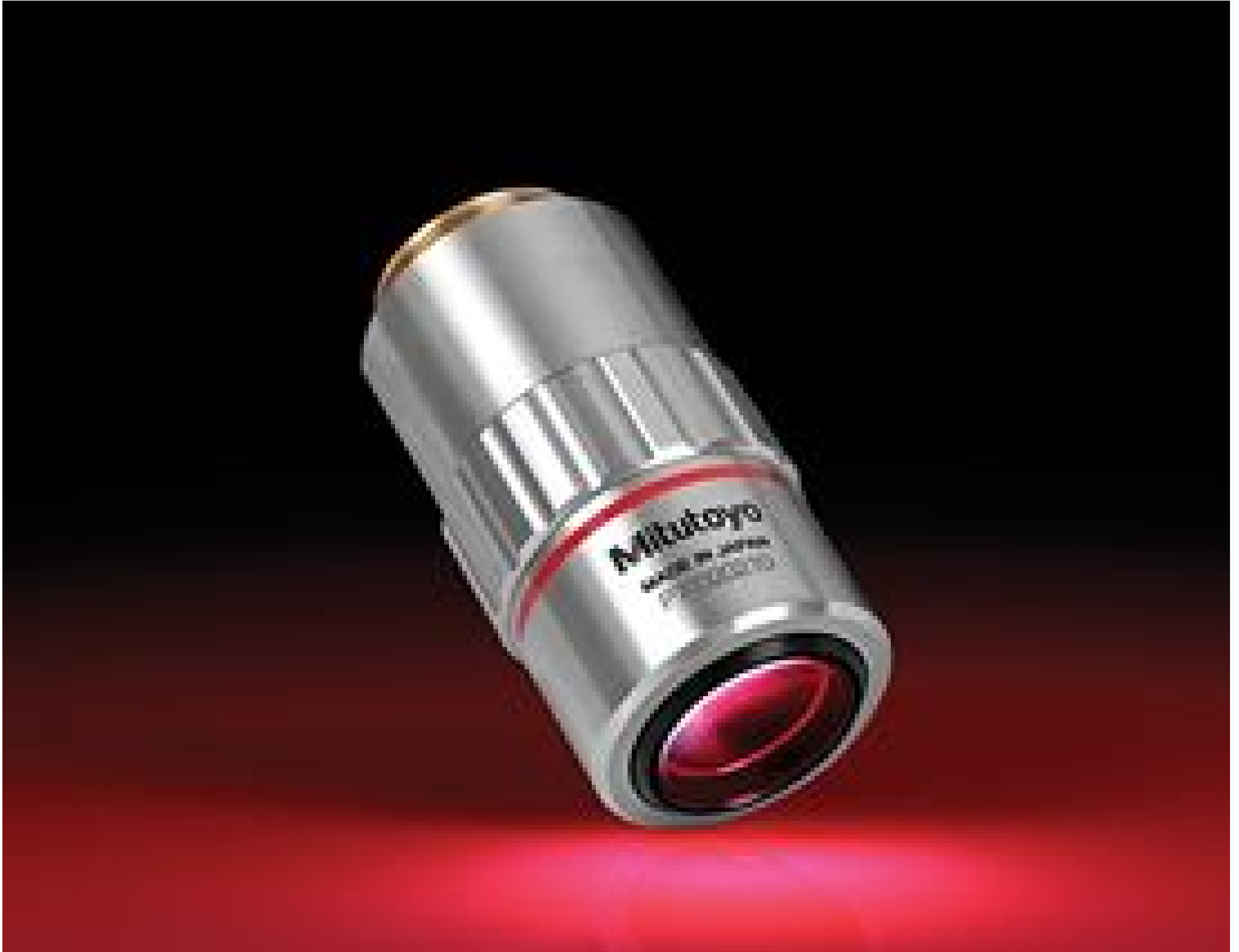
5X Mitutoyo Plan Apo Infinity Corrected Long WD Objective, #46-143