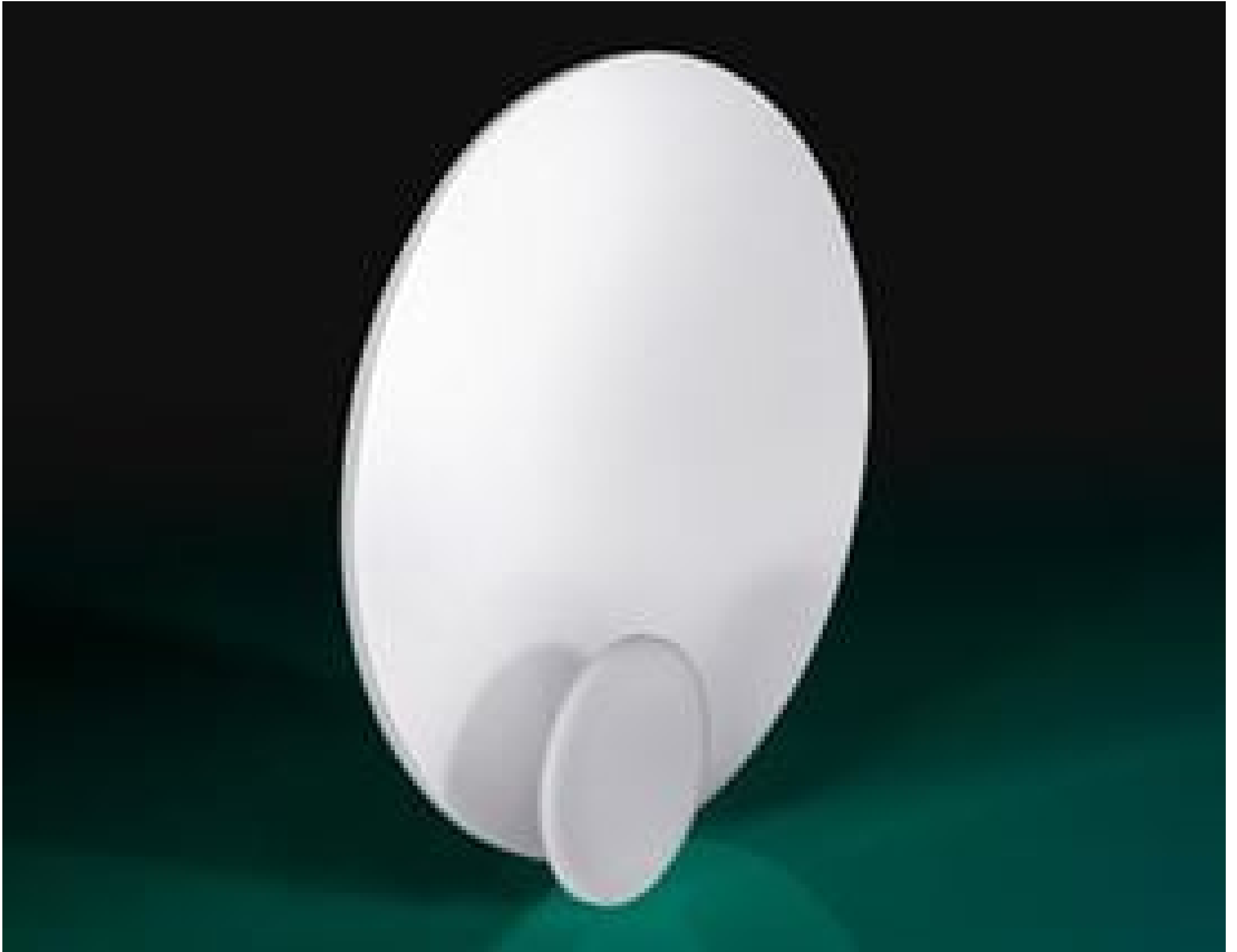
White Diffusing Glass