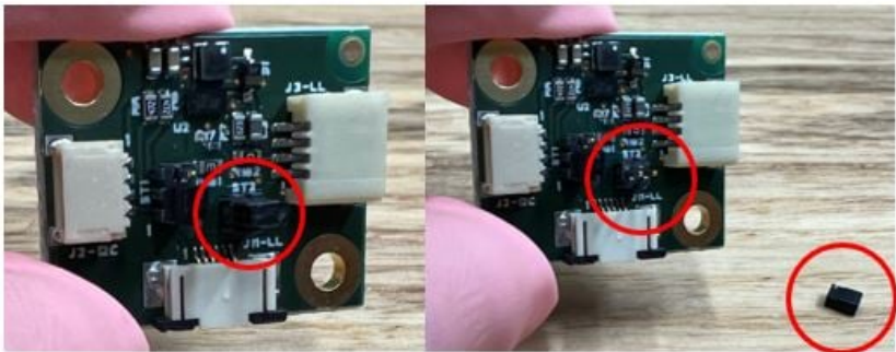
Jumper at ST2 installed