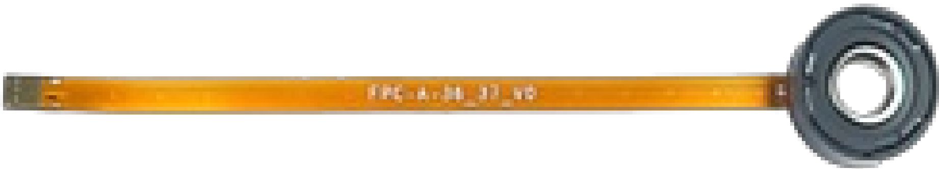
5.8mm CA, A-58Nx-P37 Corning® Varioptic® Variable Focus Liquid Lens