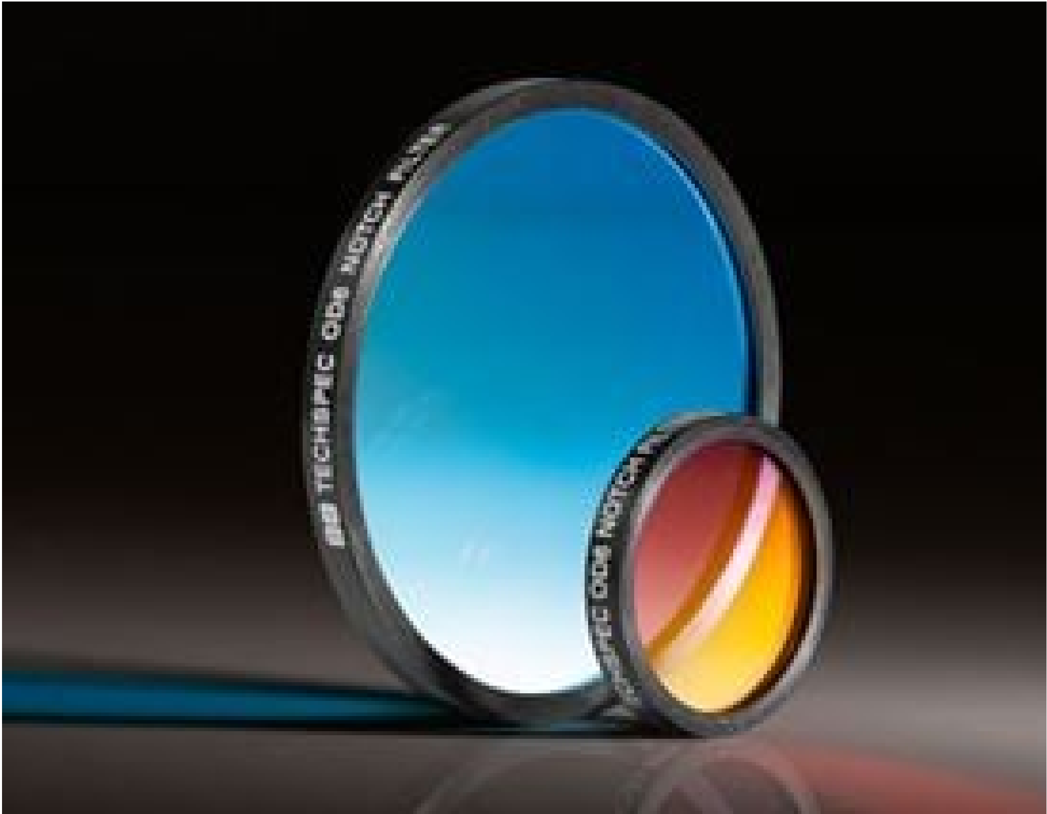
TECHSPEC OD 6.0 Notch Filters