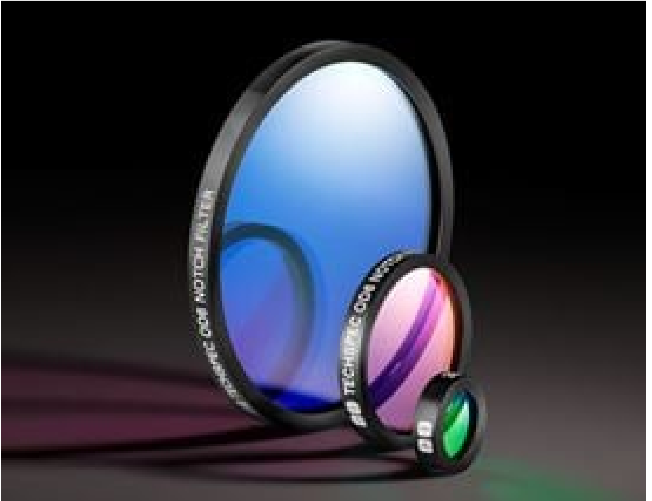
TECHSPEC OD 6.0 Multi-Notch Filters for Nd:YAG Lasers