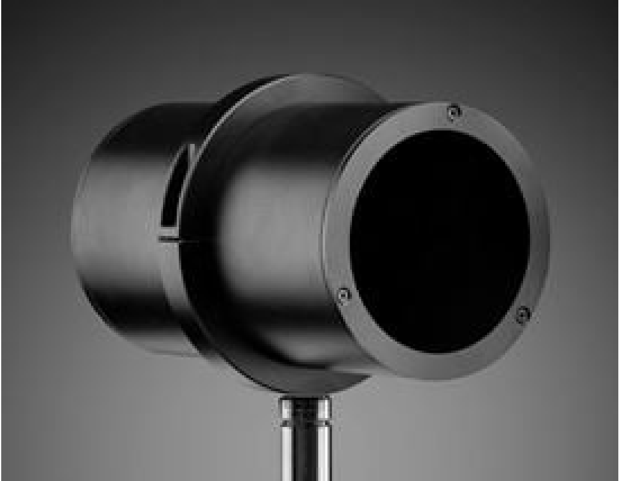
Acktar Blackened Laser Beam Trap