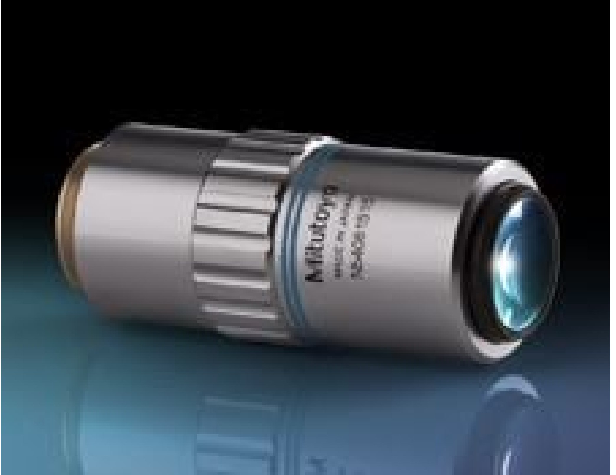
50X Mitutoyo Plan Apo SL Infinity Corrected Objective, #46-399