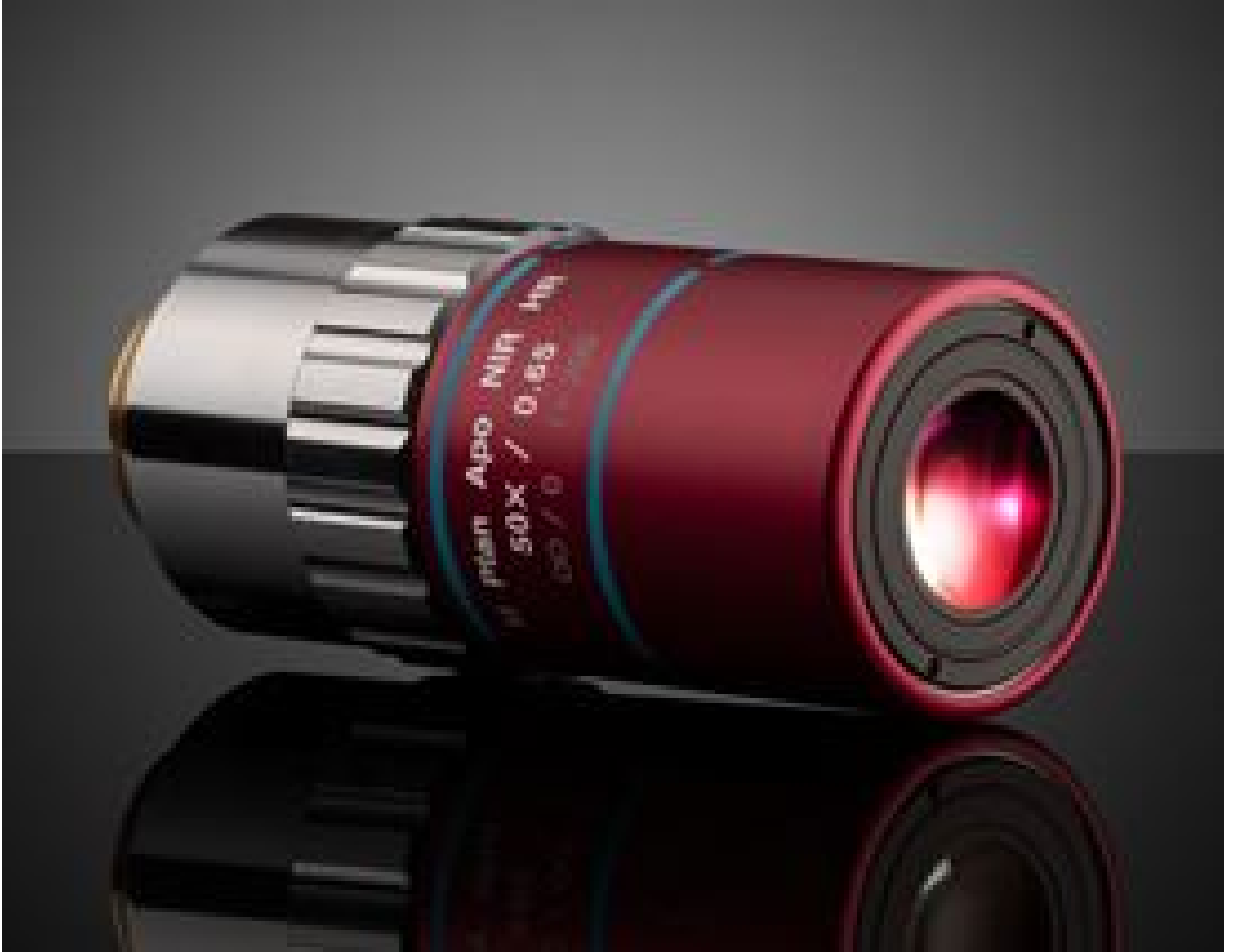
50X Mitutoyo Plan Apo NIR HR Infinity Corrected Objective, #56-982