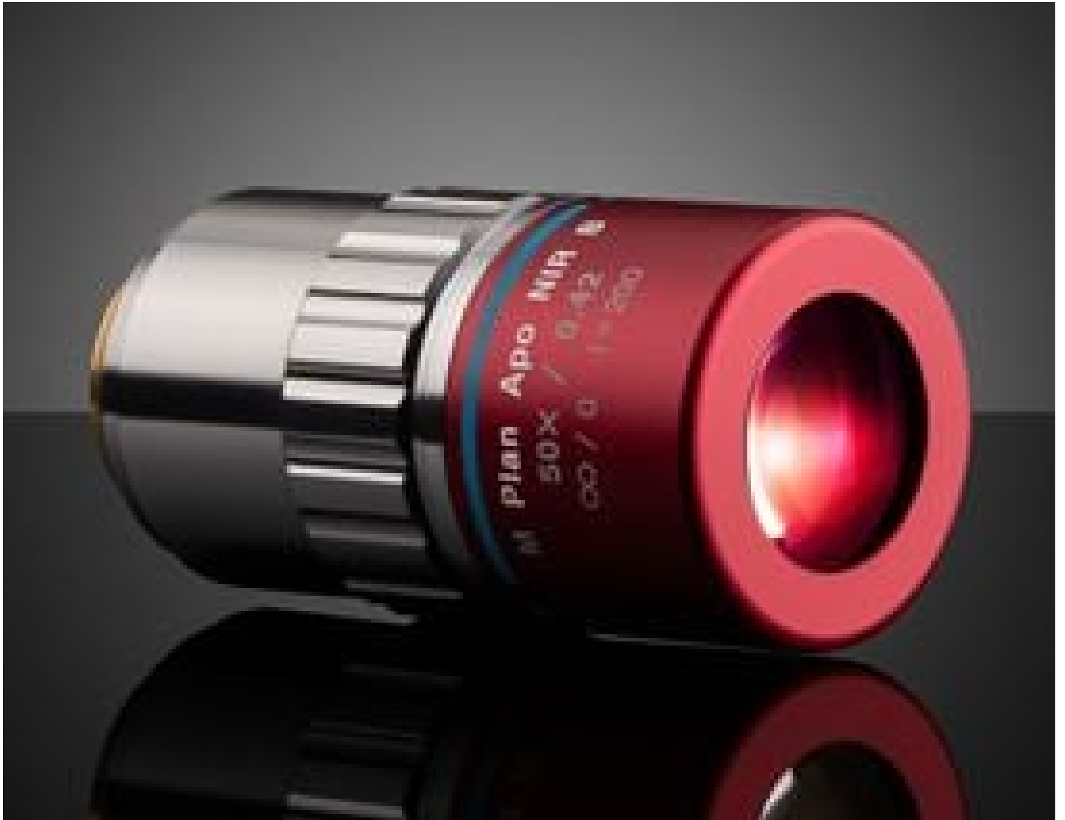
50X Mitutoyo Plan Apo NIR B Infinity Corrected Objective, #89-351