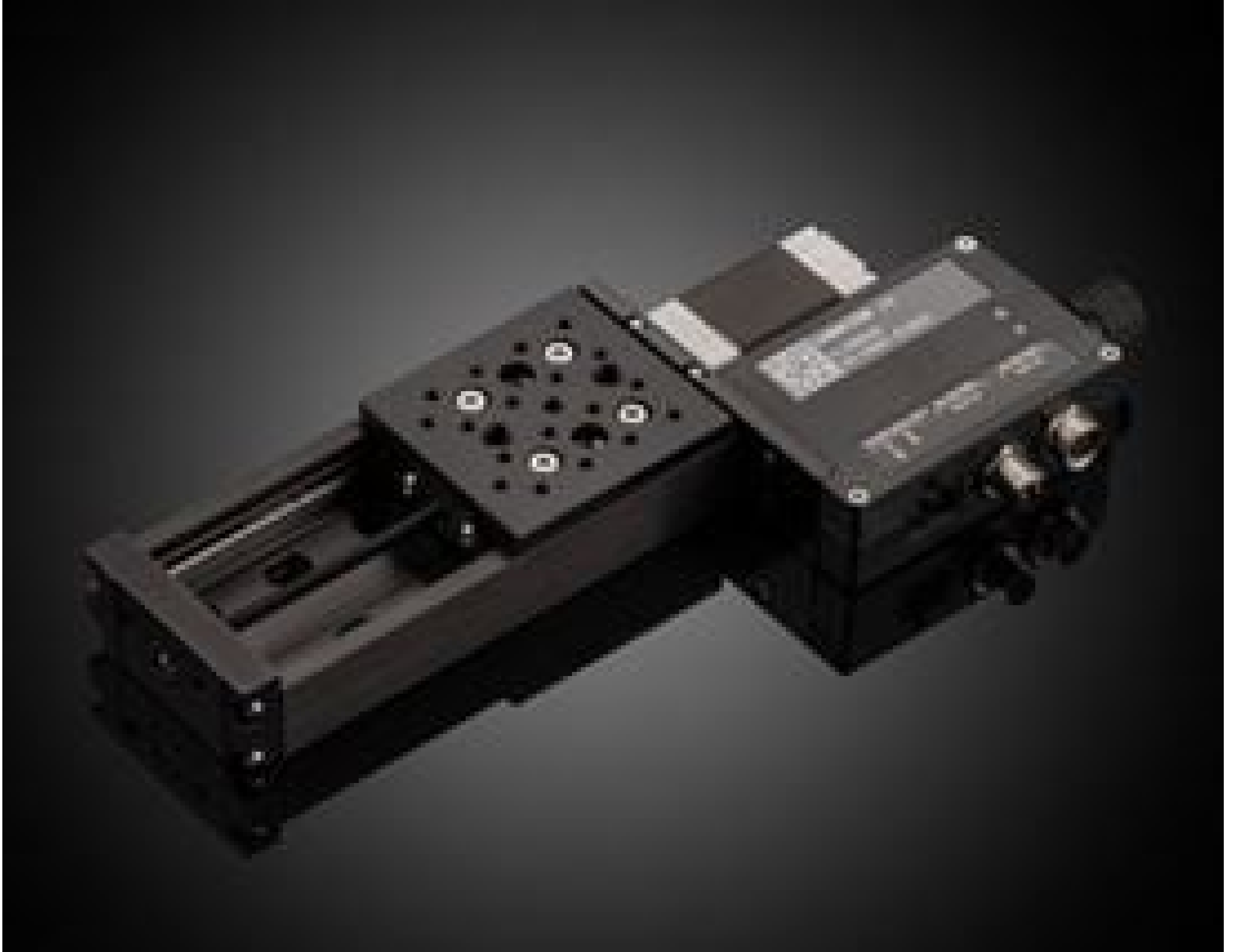
#15-286, 50mm Travel, Motorized Linear Stage, Integrated Controller