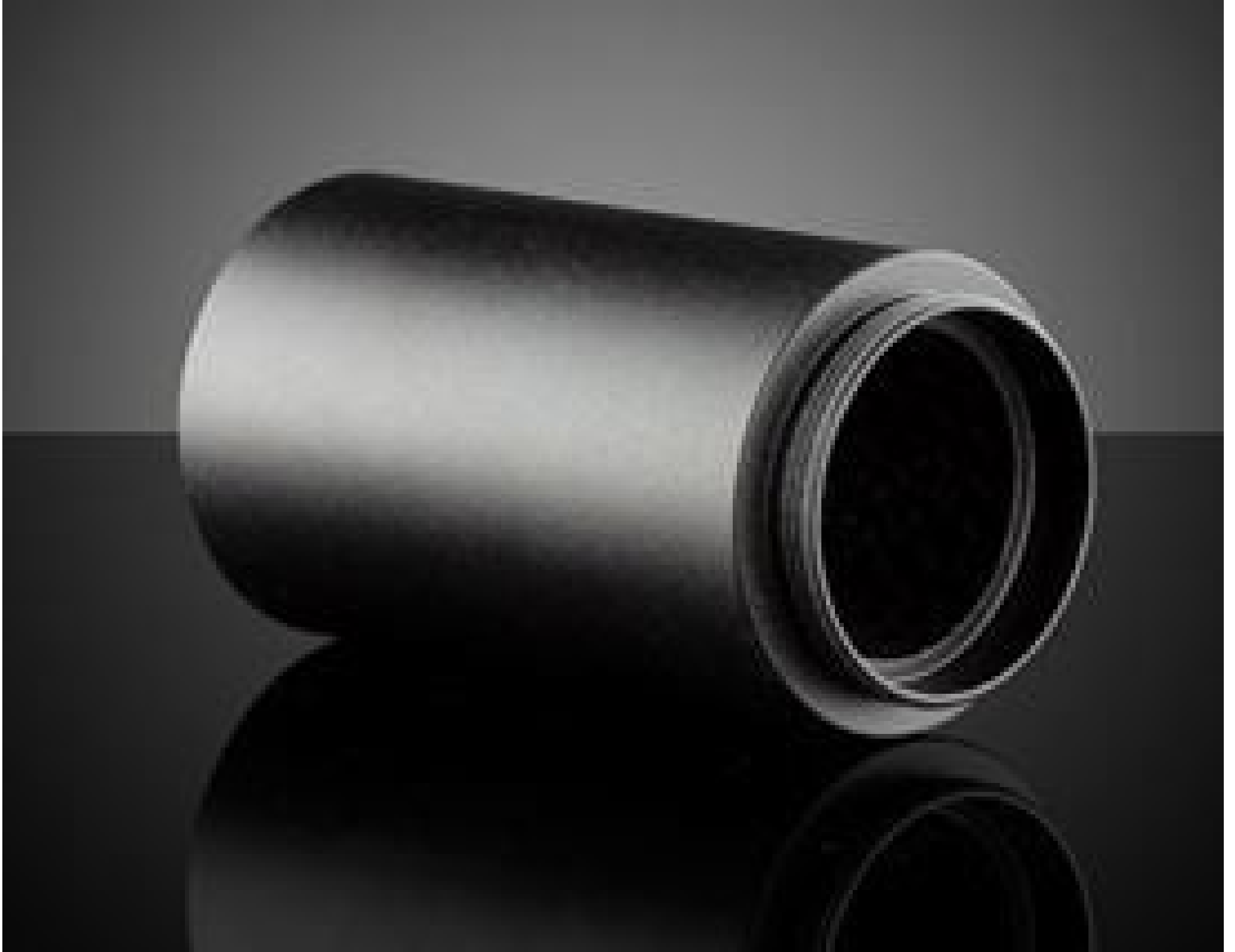
50mm Length, Acktar Hexa-Black™ C-Mount Noise Reduction Extension Tube