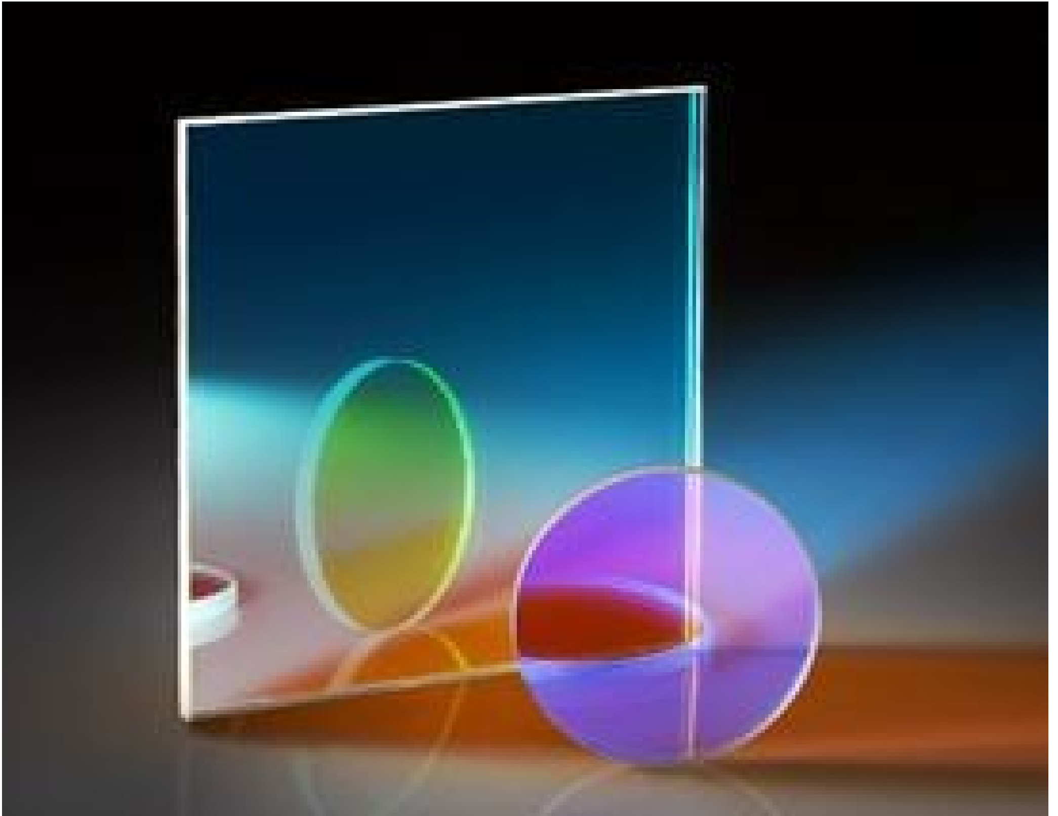
Additive and Subtractive Dichroic Color Filters