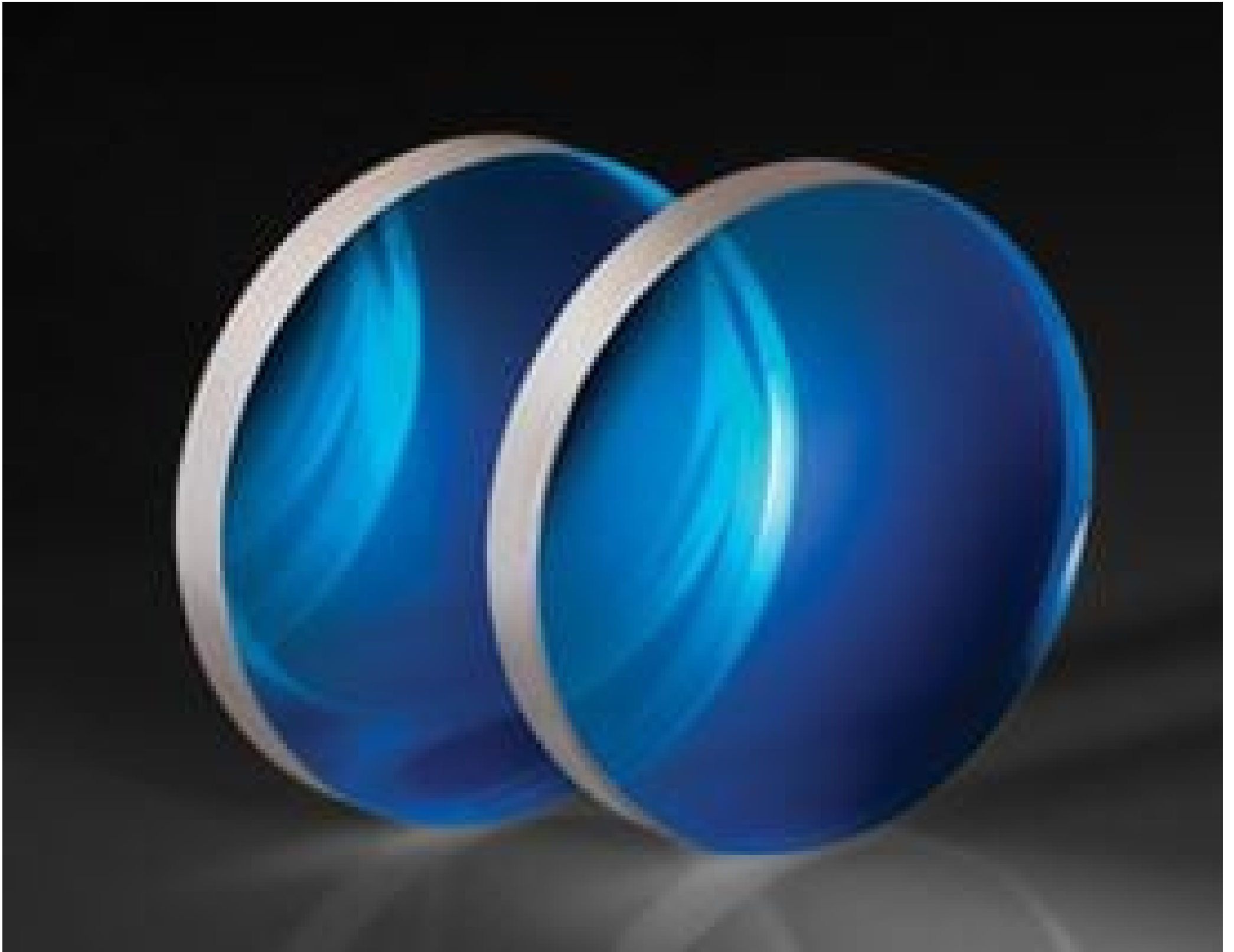
TECHSPEC® λ/10 Plate Beamsplitters