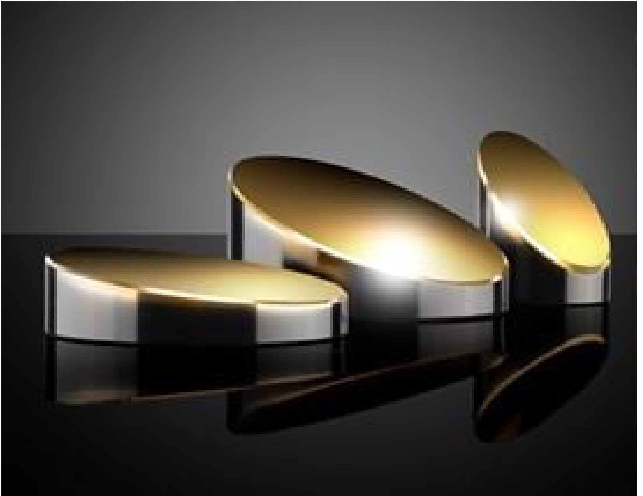
TECHSPEC Gold Off-Axis Parabolic Mirrors