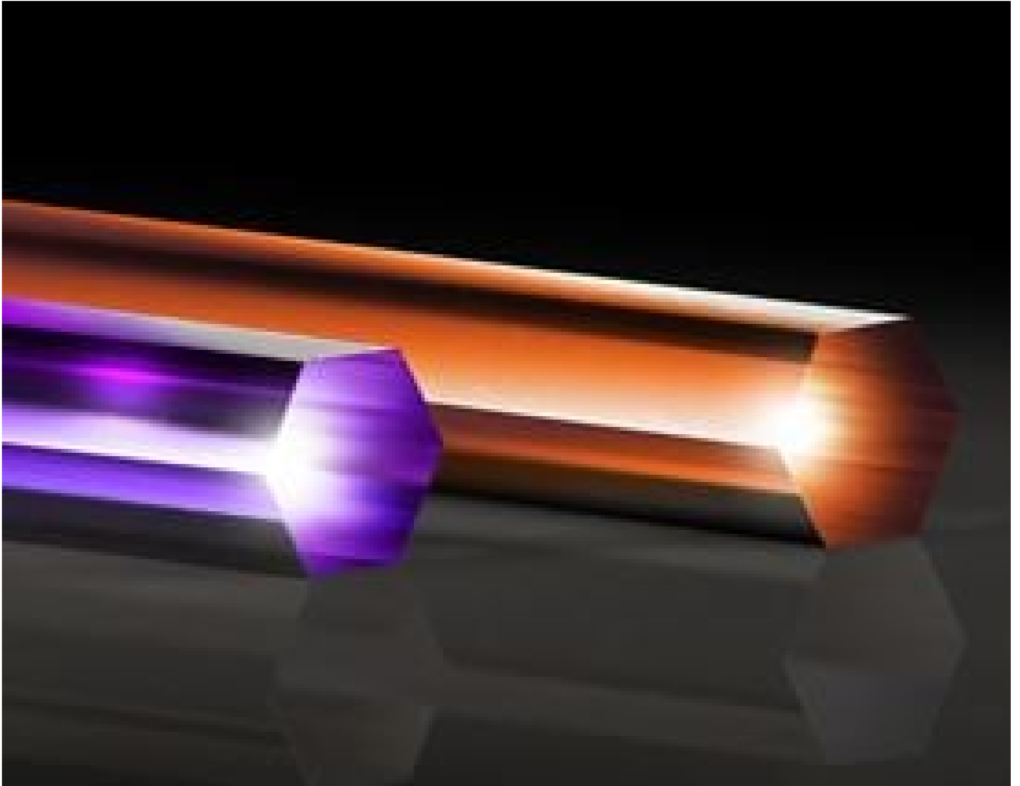
Fused Silica Light Pipe Homogenizing Rods