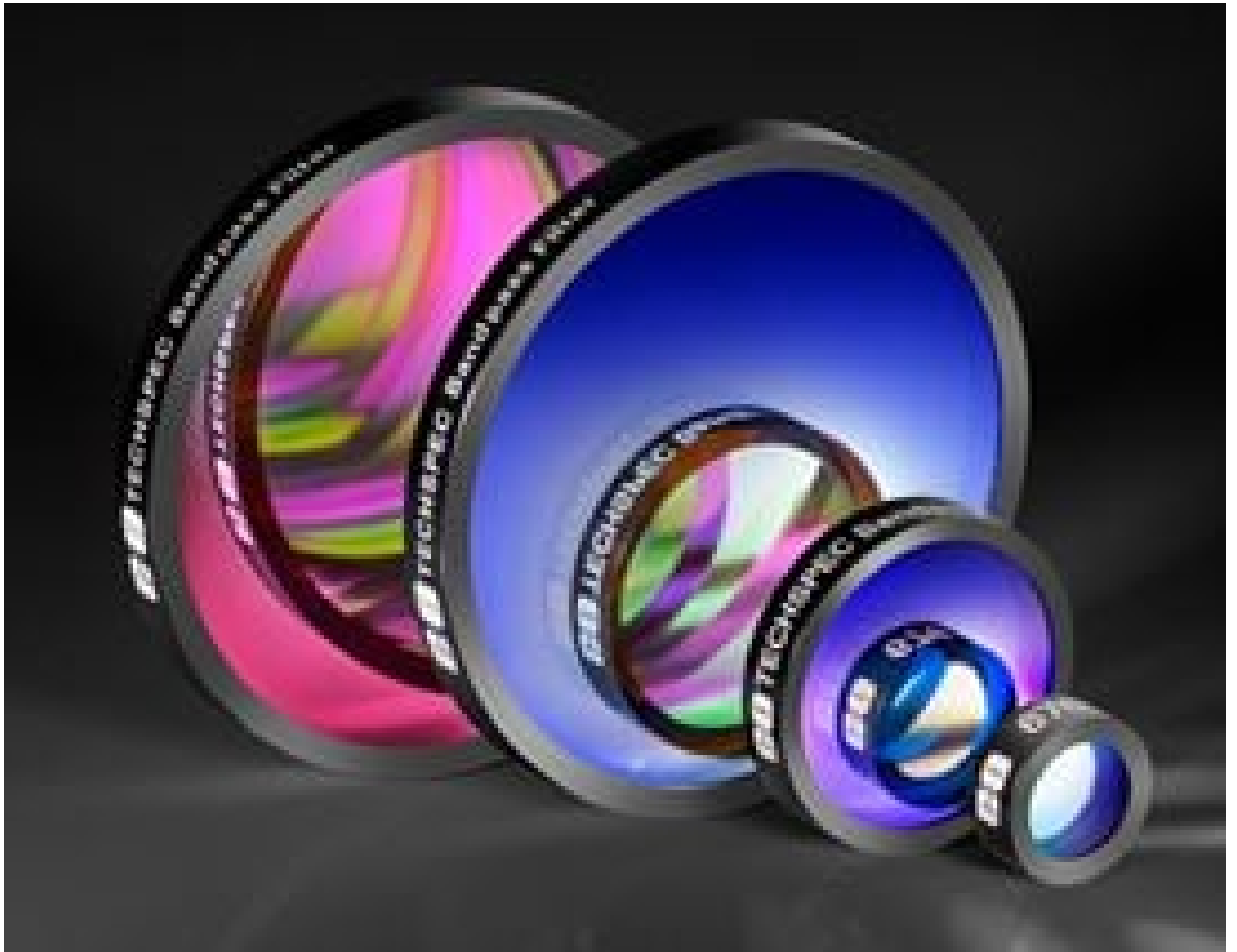
TECHSPEC Hard Coated OD 4.0 10nm Bandpass Filters