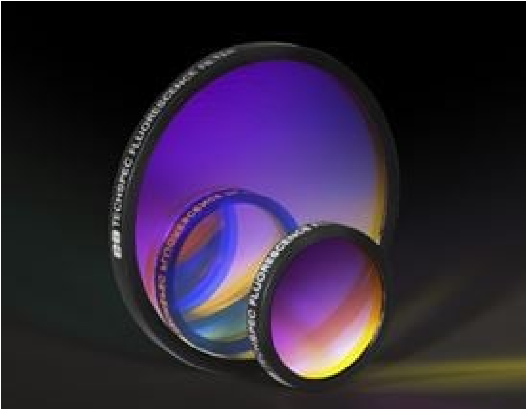
Multi-Band Fluorescence Bandpass Filters