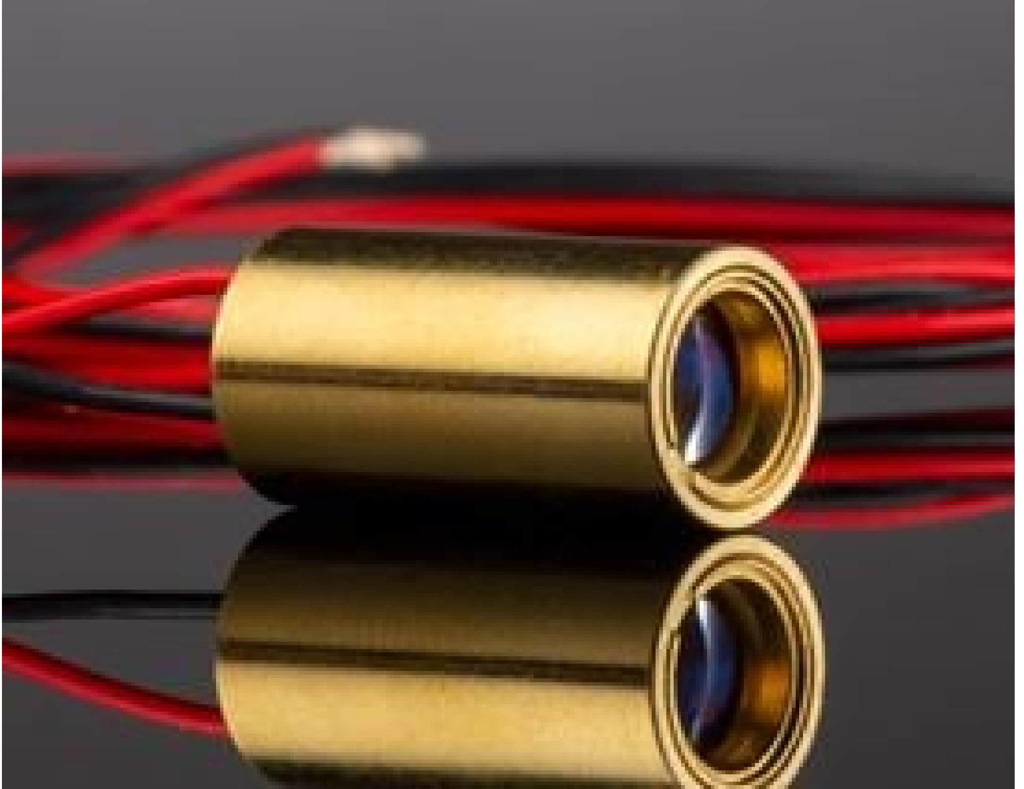
Coherent® Micro VLM™ Laser Diode