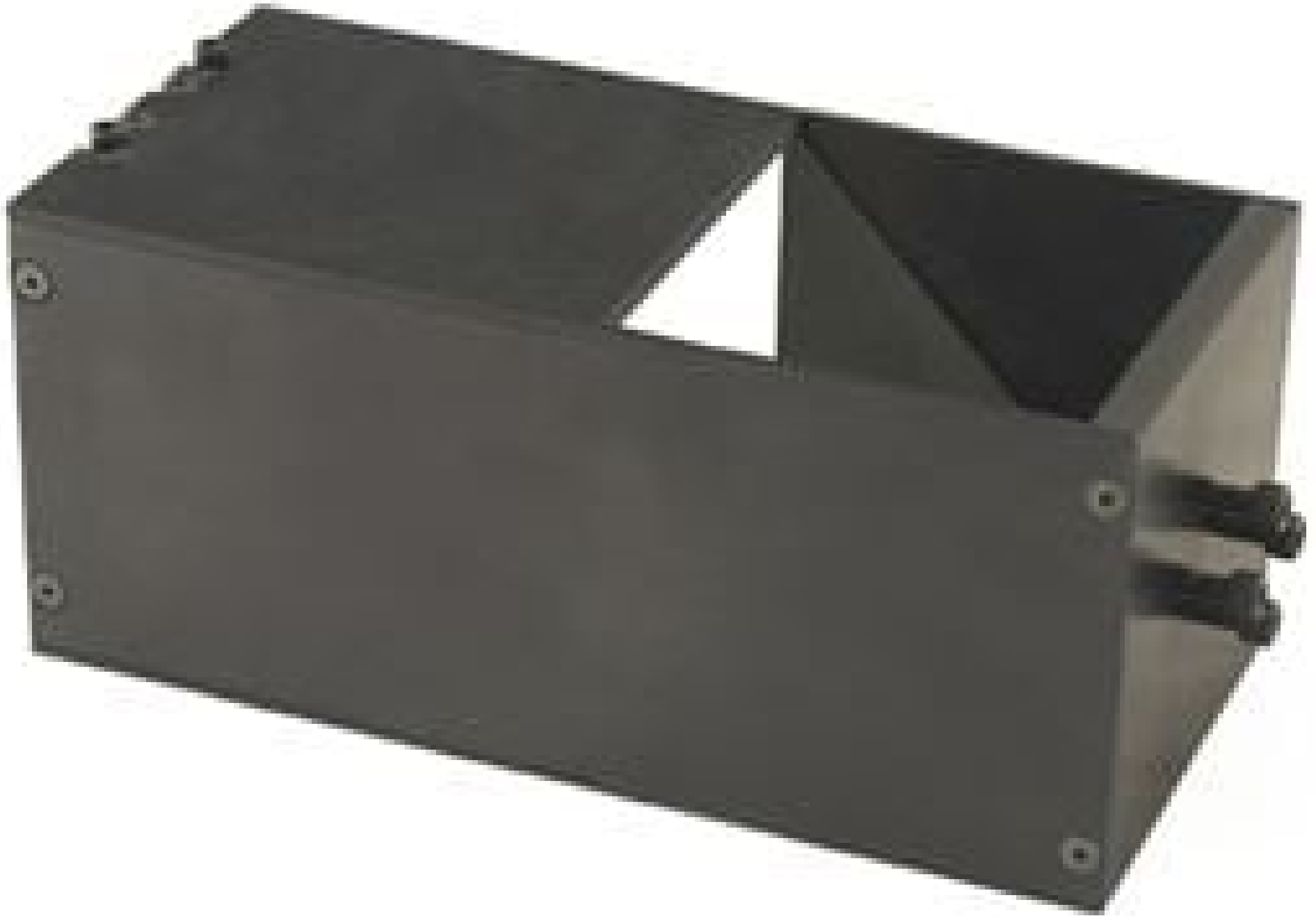
4" Fiber Optic Diffuse Axial Illuminators (#53-381)