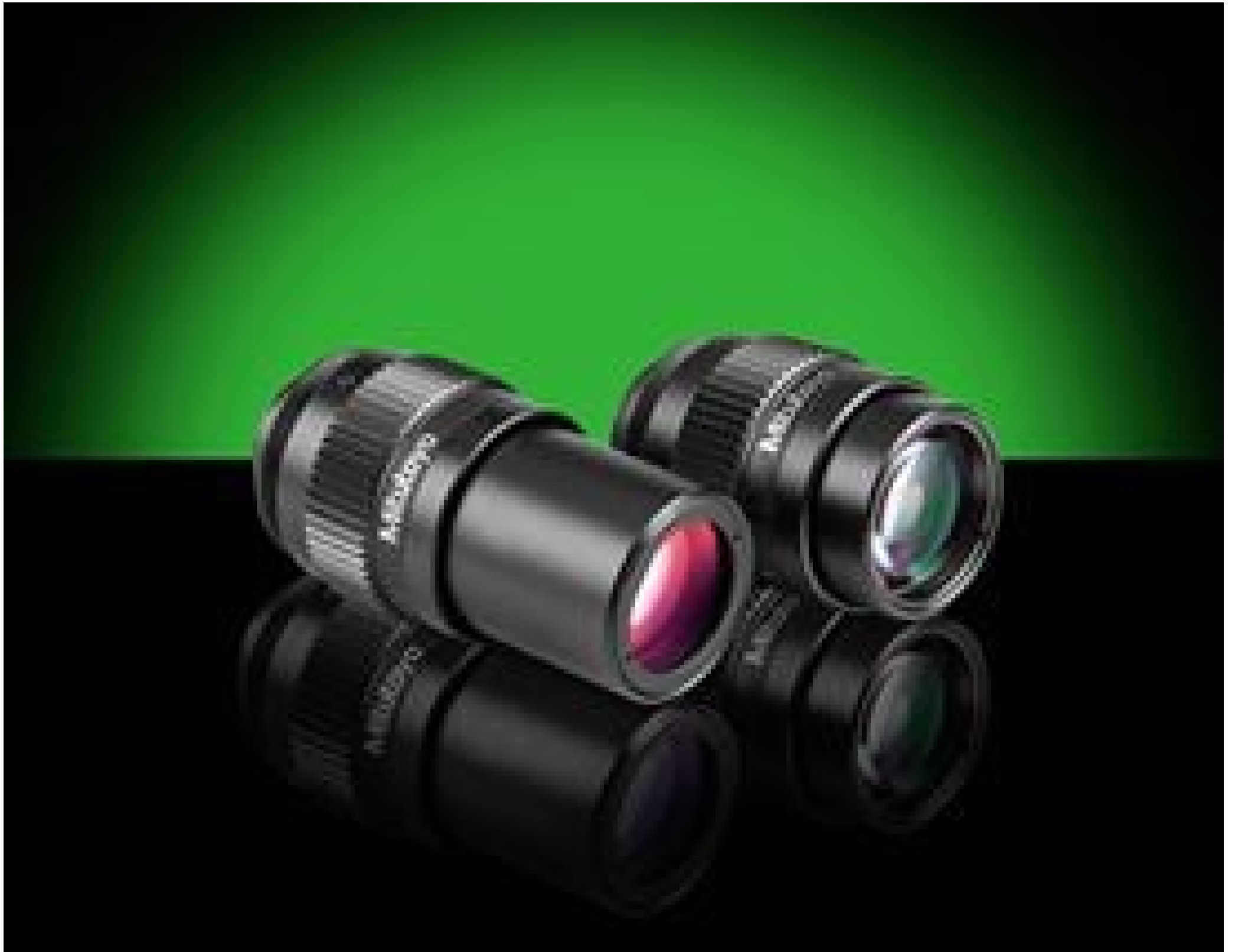
3X (#56-985) & 5X (#56-986)