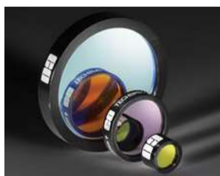
#65-737 - 650nm CWL, 80nm FWHM, 12.5mm Mounted Diameter £59.96