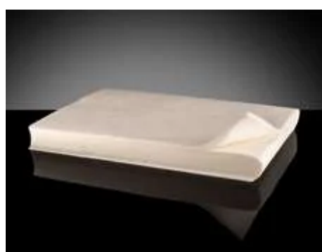
#60-375 - 7.75" x 4" Sheets, Industrial Grade Lens Tissue £31.60