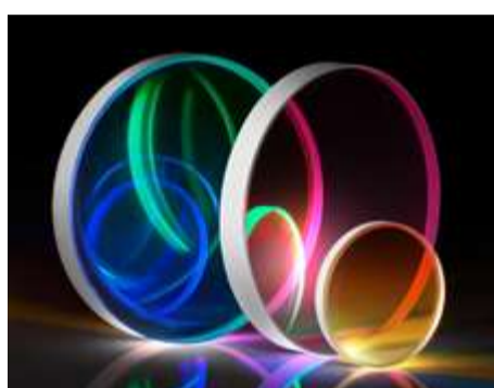
#64-653 - 1125nm 25mm Diameter, OD 2.0 Shortpass Filter £104.00