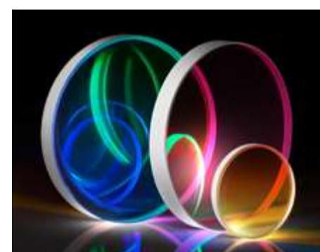
#67-285 - 1150nm 12.5mm Diameter, OD 2.0 Shortpass Filter £72.00