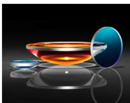
UV Fused Silica Plano-Convex (PCX) Lenses - YAG-BBAR Coated