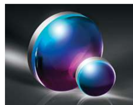
YAG-BBAR Coated Double-Convex (DCX) Lenses