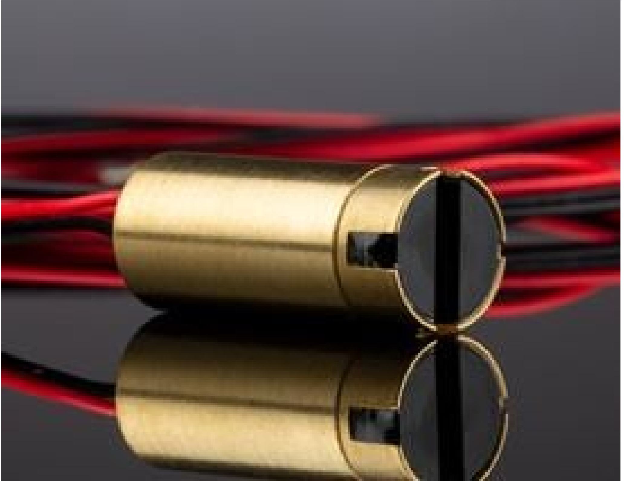
Coherent® Micro VLM™ Laser Diode - Line Option