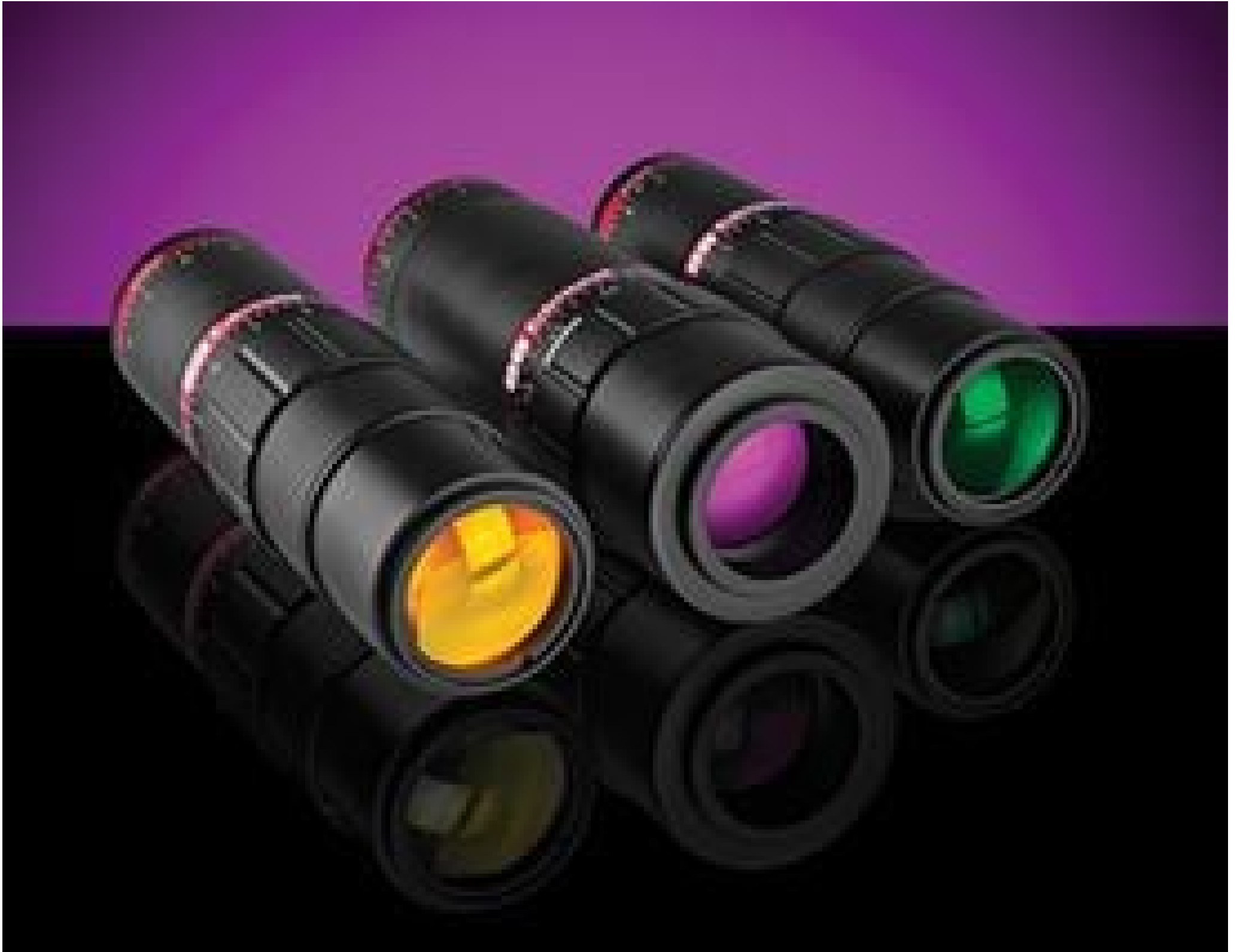
Research-Grade Variable Beam Expanders