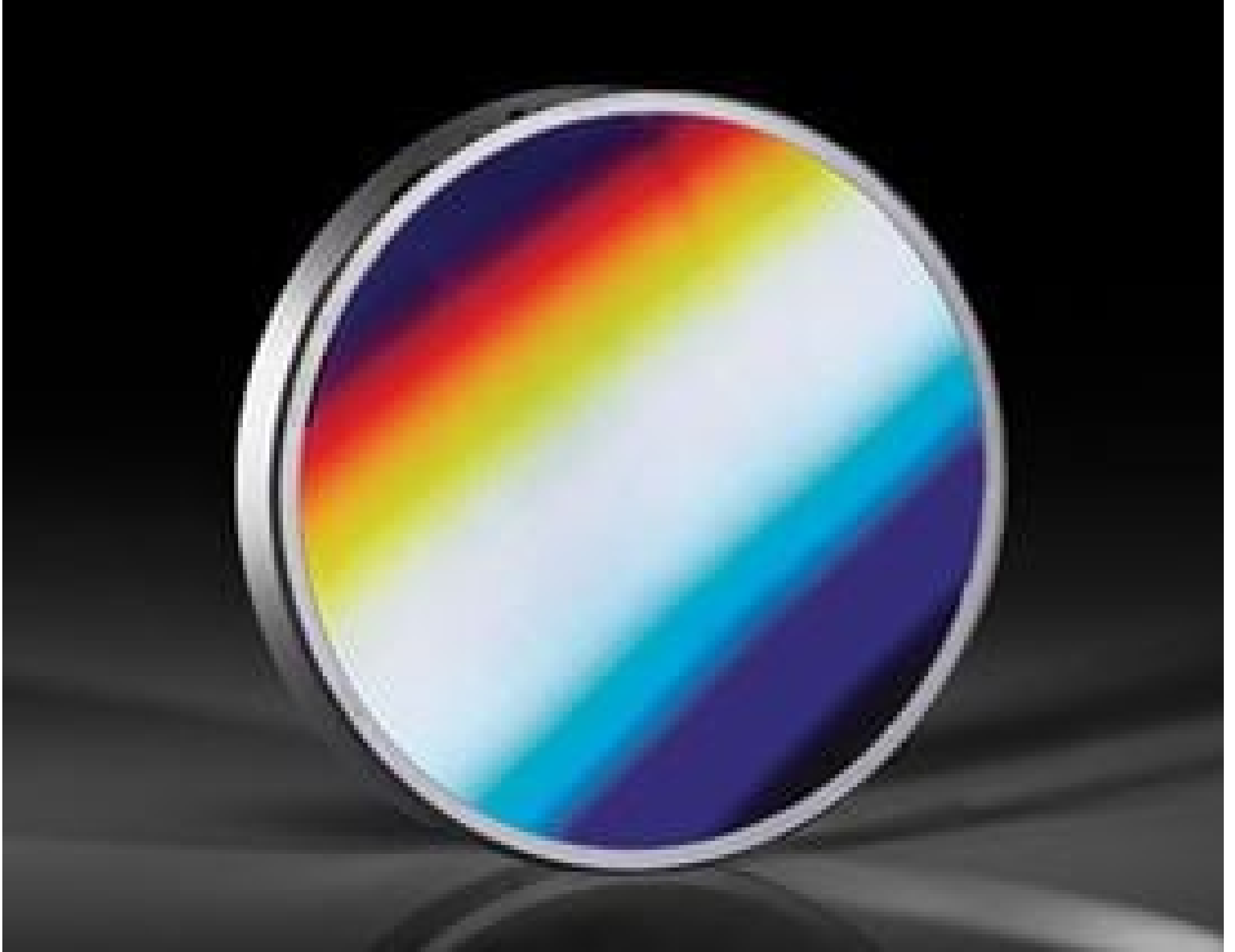
ZEISS Concave Diffraction Gratings