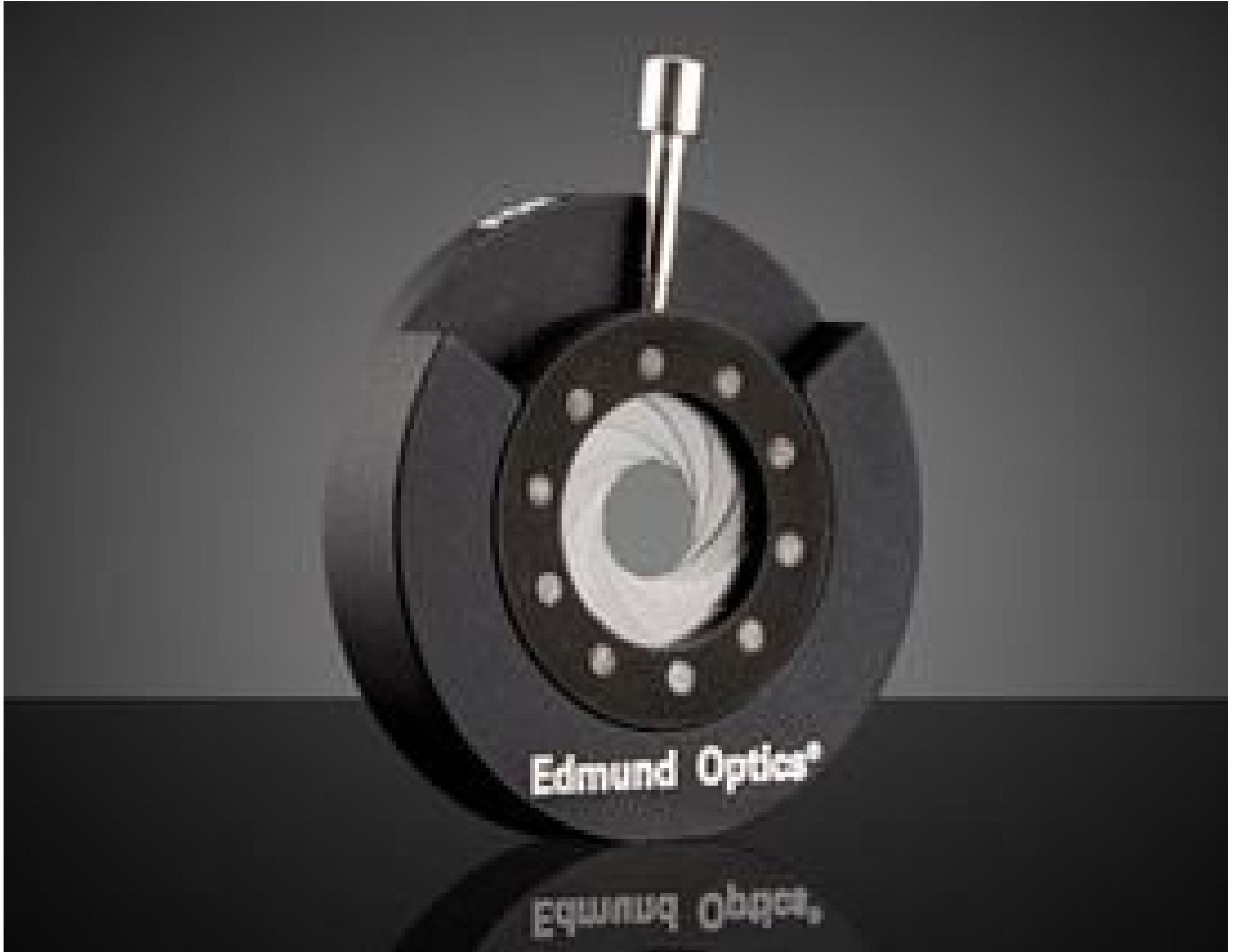
30.8mm Outer Diameter, Mounted Iris Diaphragm, #53-914