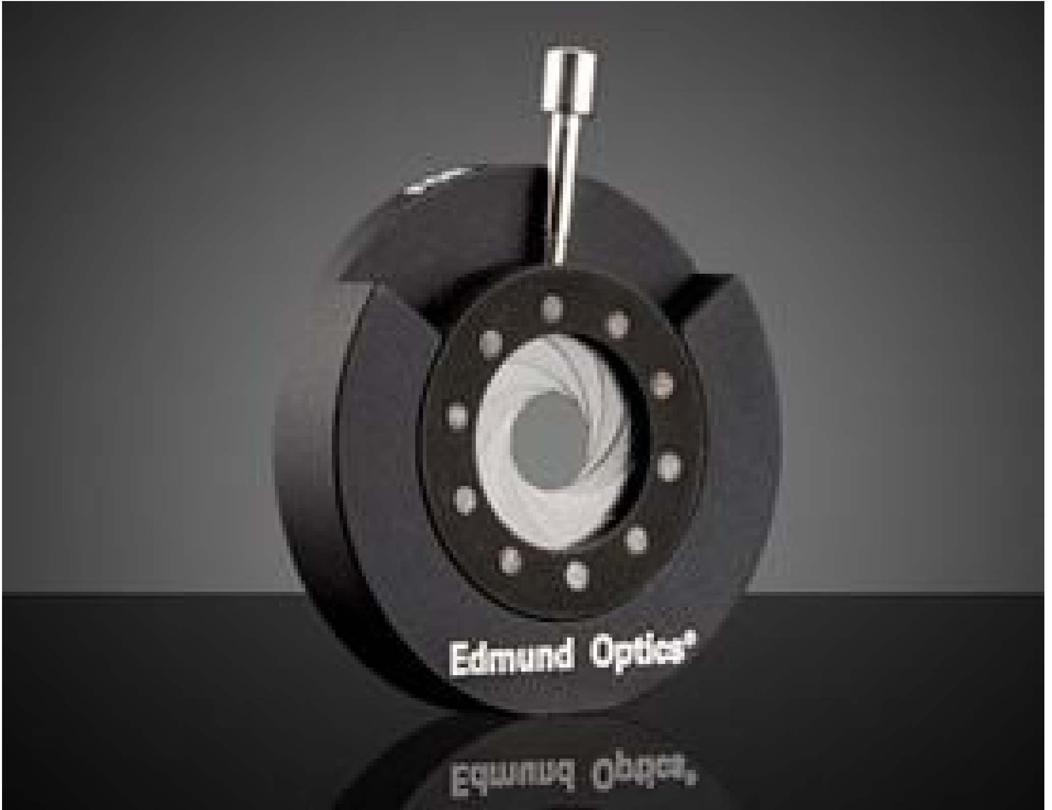
30.8mm Outer Diameter, Mounted Iris Diaphragm, #53-914