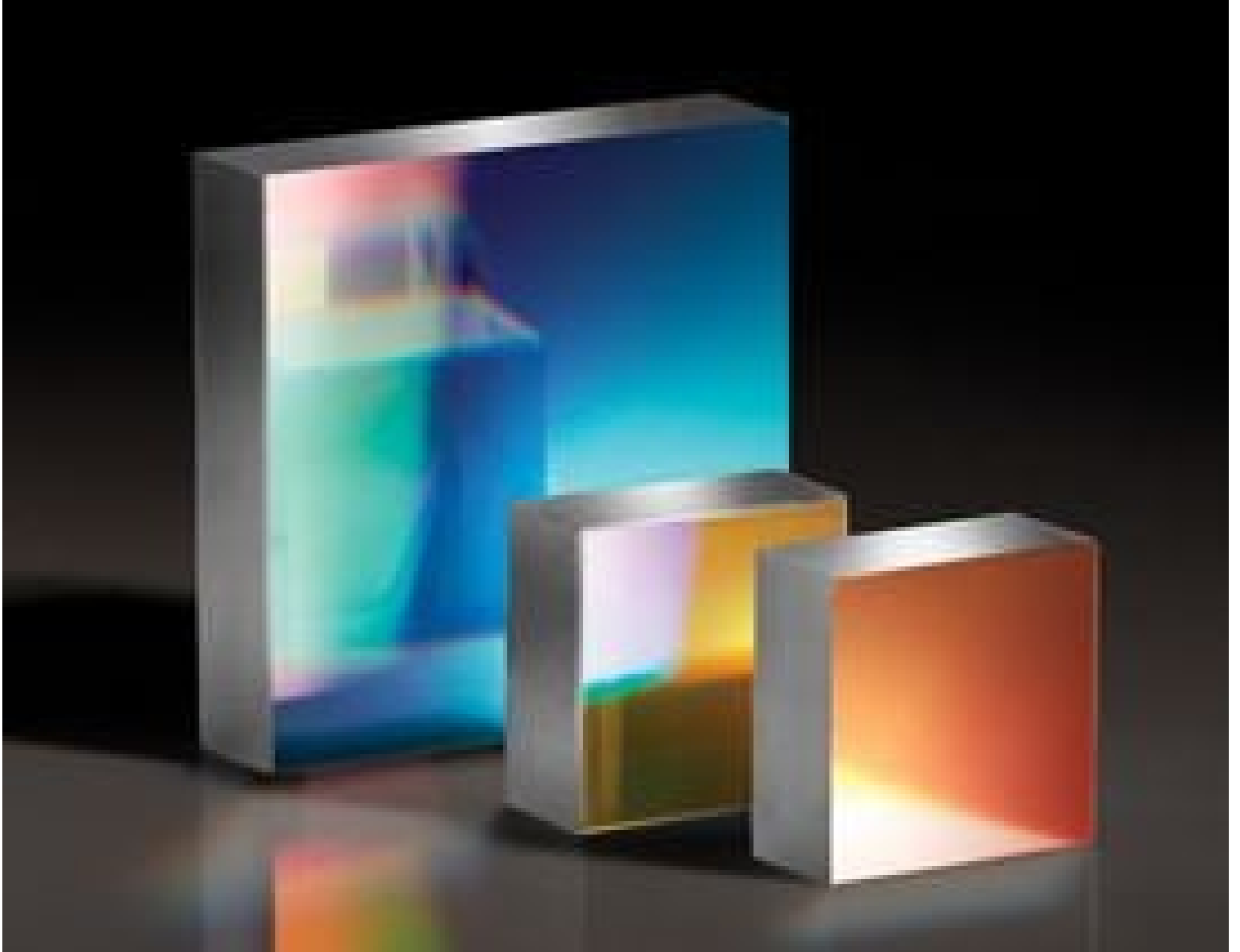
Richardson Gratings™ High Precision Plane Ruled Reflective Diffraction Gratings