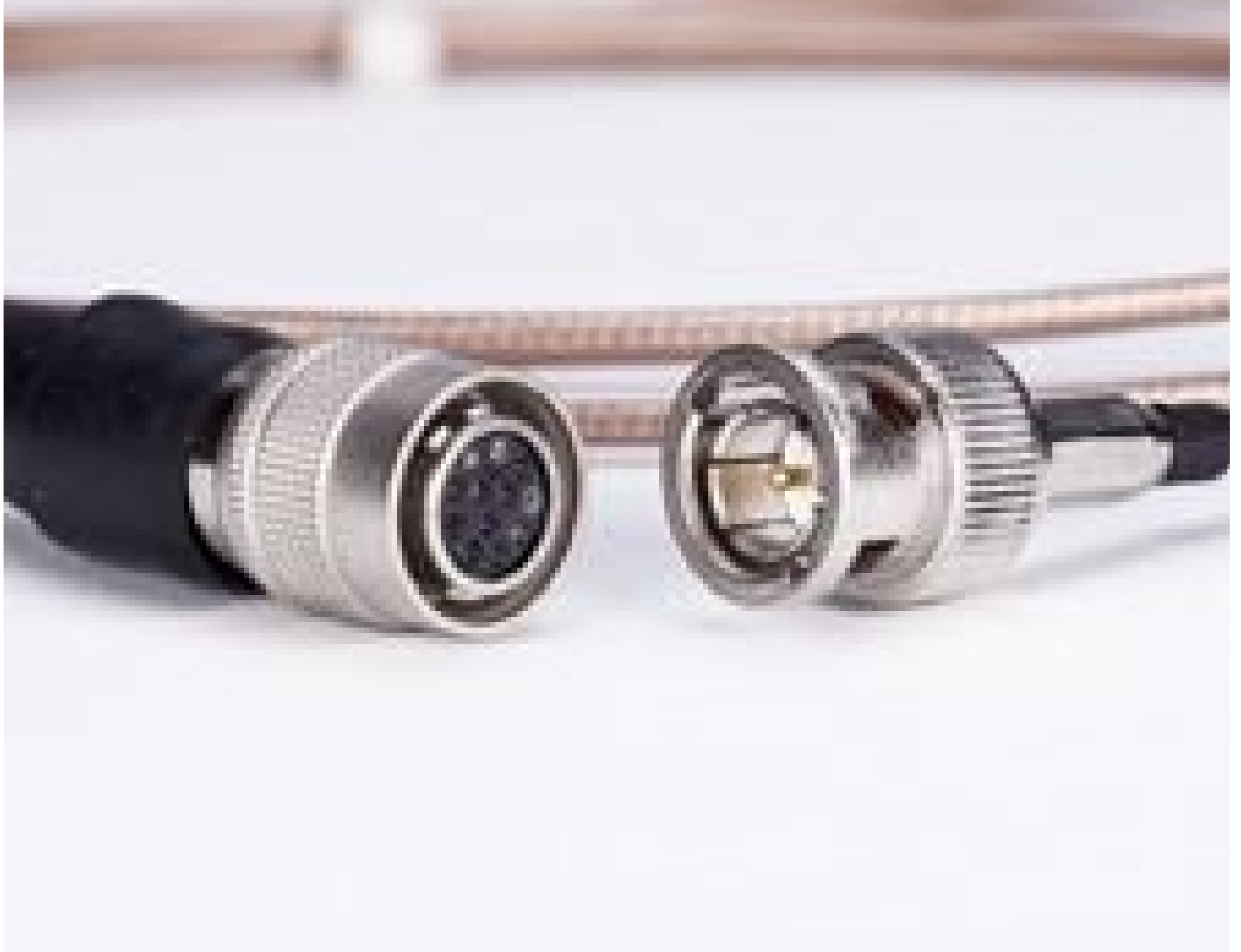
2m Trigger Cable with BNC Connector, #88-367