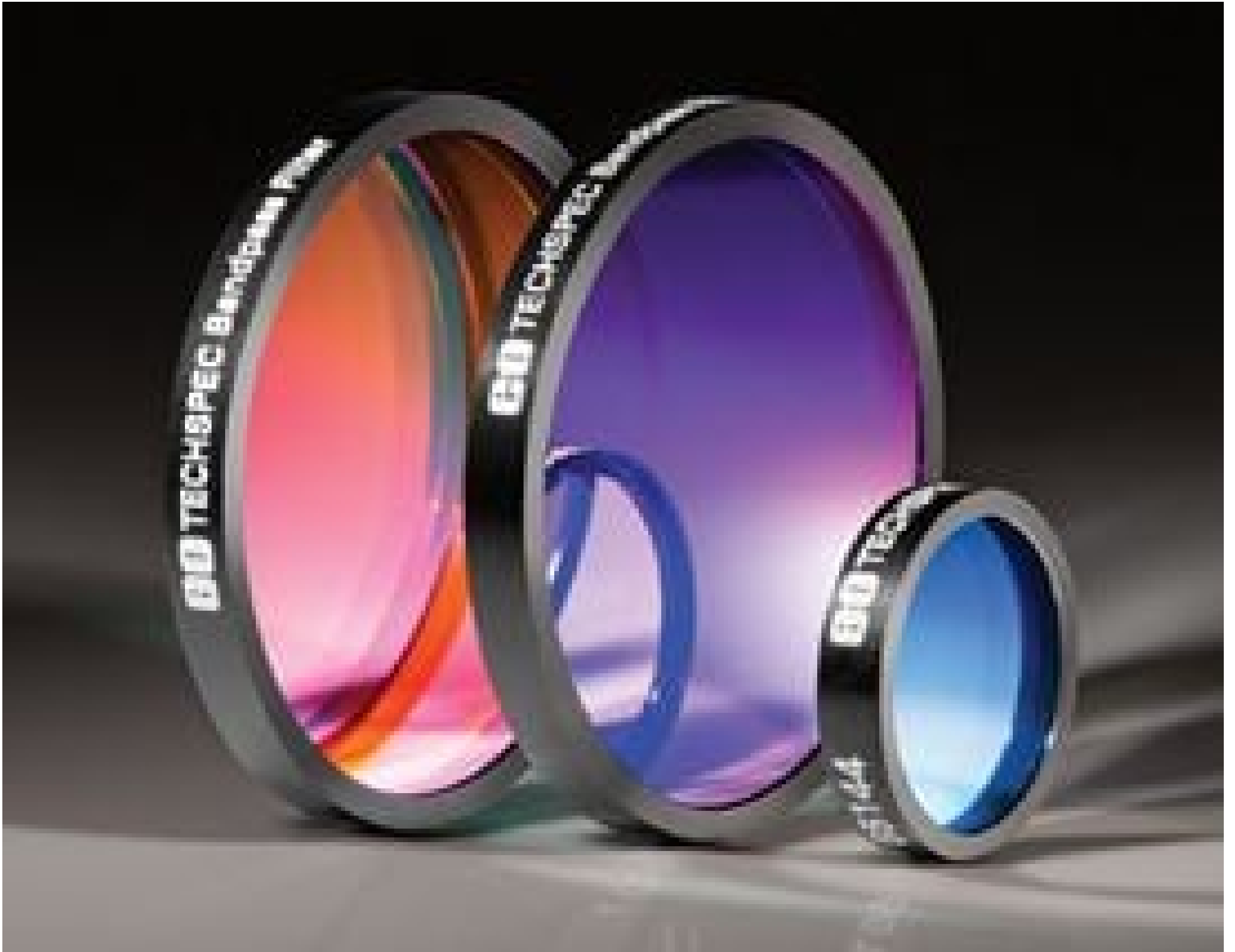
TECHSPEC Hard Coated OD 4.0 5nm Bandpass Filters