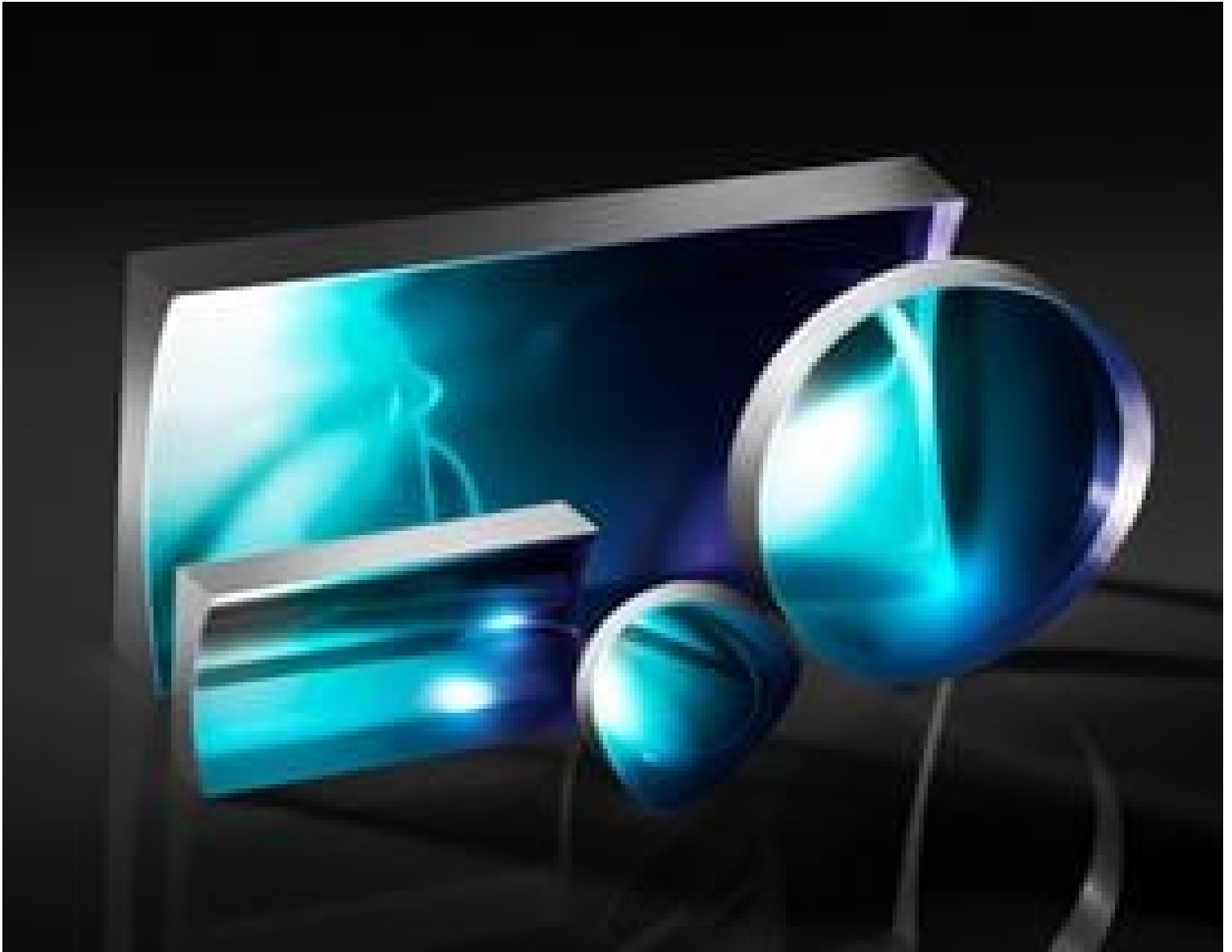
TECHSPEC® Illumination Grade PCV Cylinder Lenses