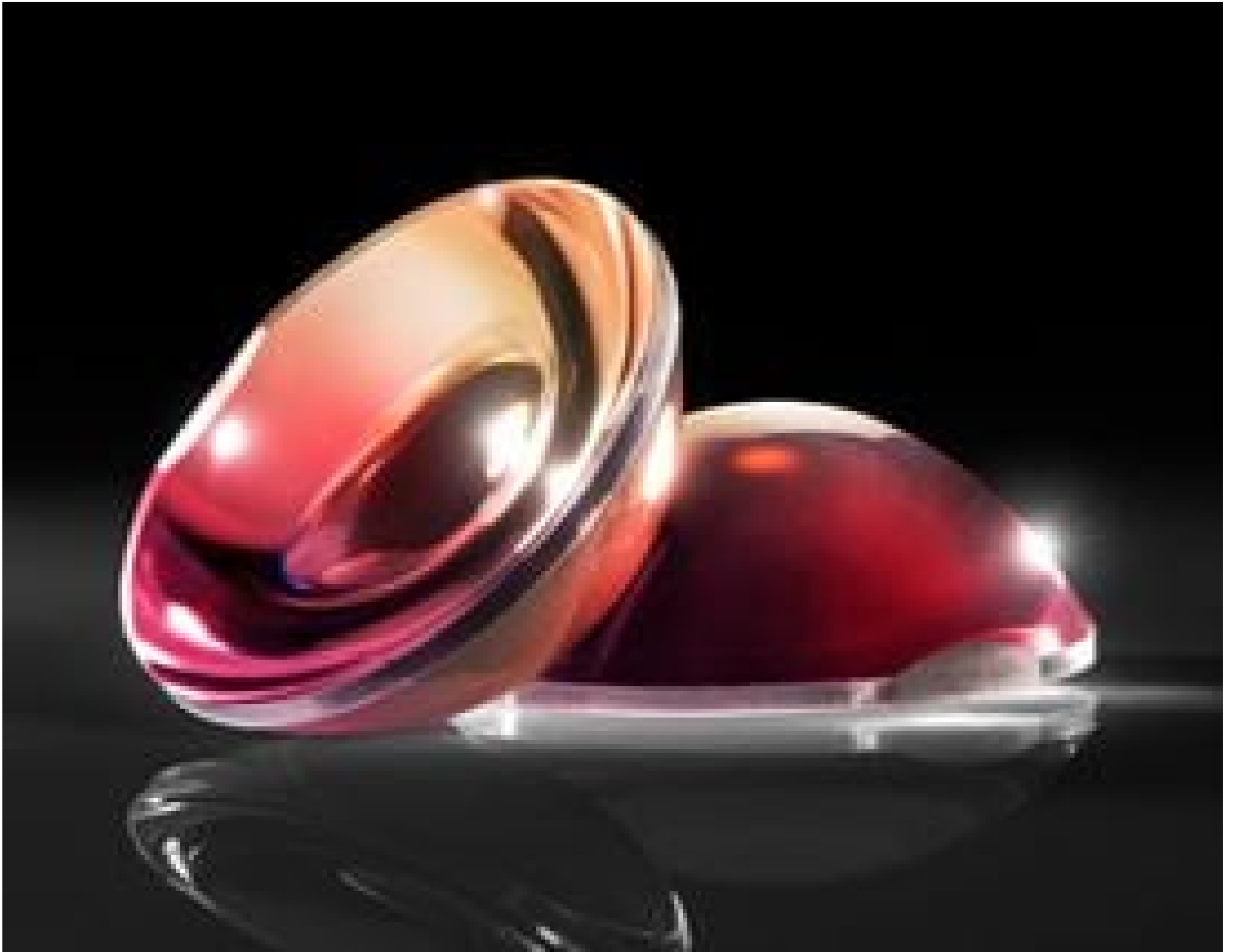
TECHSPEC® Plastic Aspheric Lenses