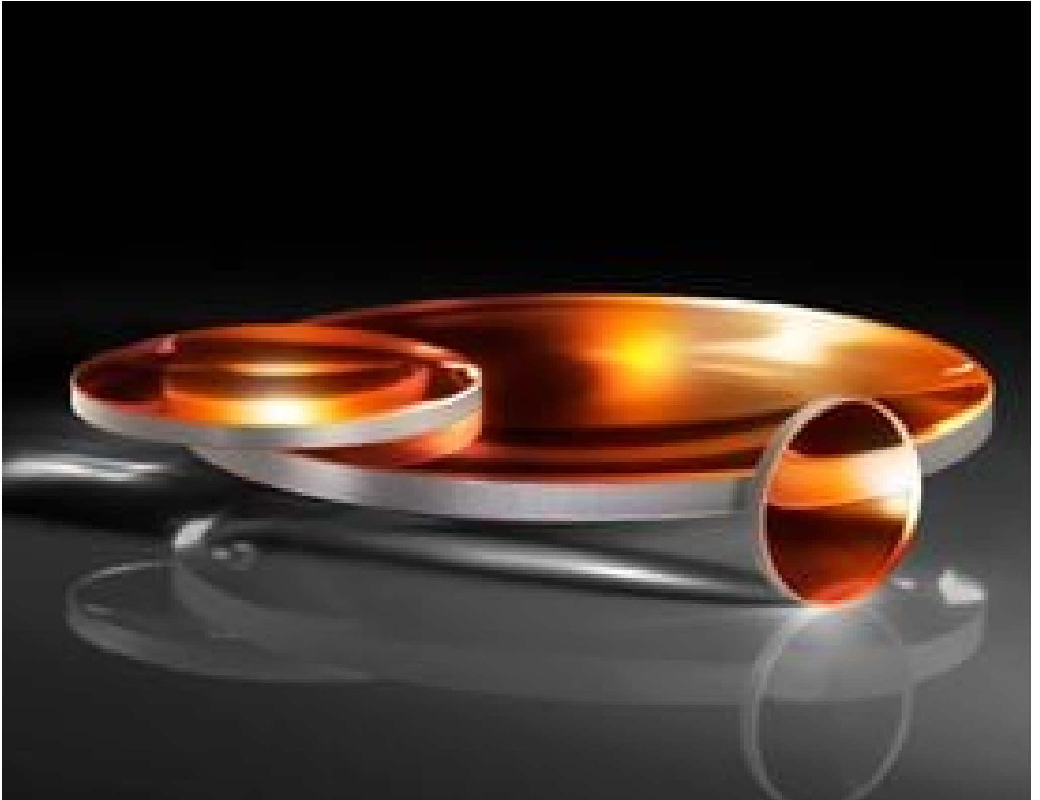
TECHSPEC Calcium Fluoride Plano-Convex (PCX) Lenses