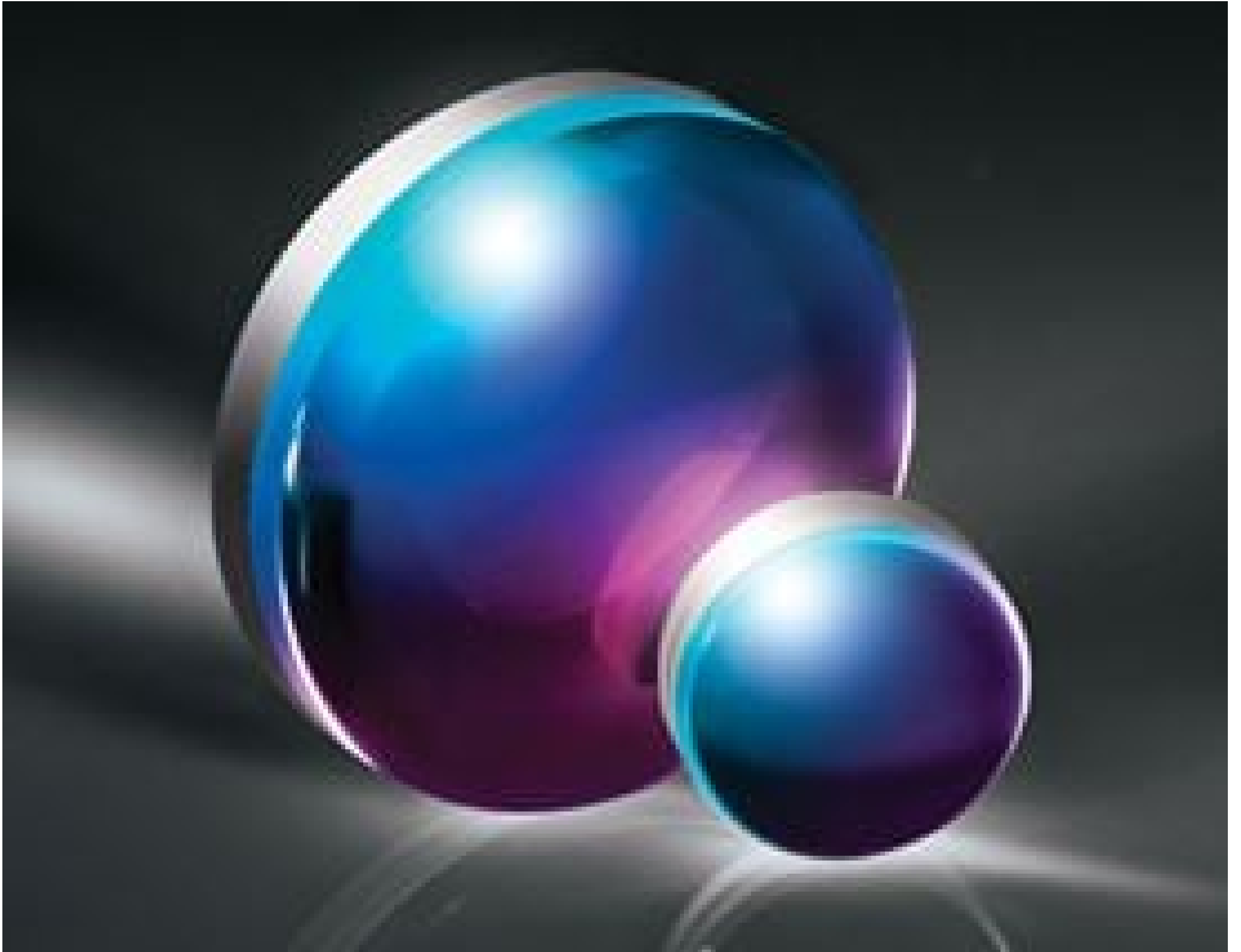
YAG-BBAR Coated Double-Convex (DCX) Lenses