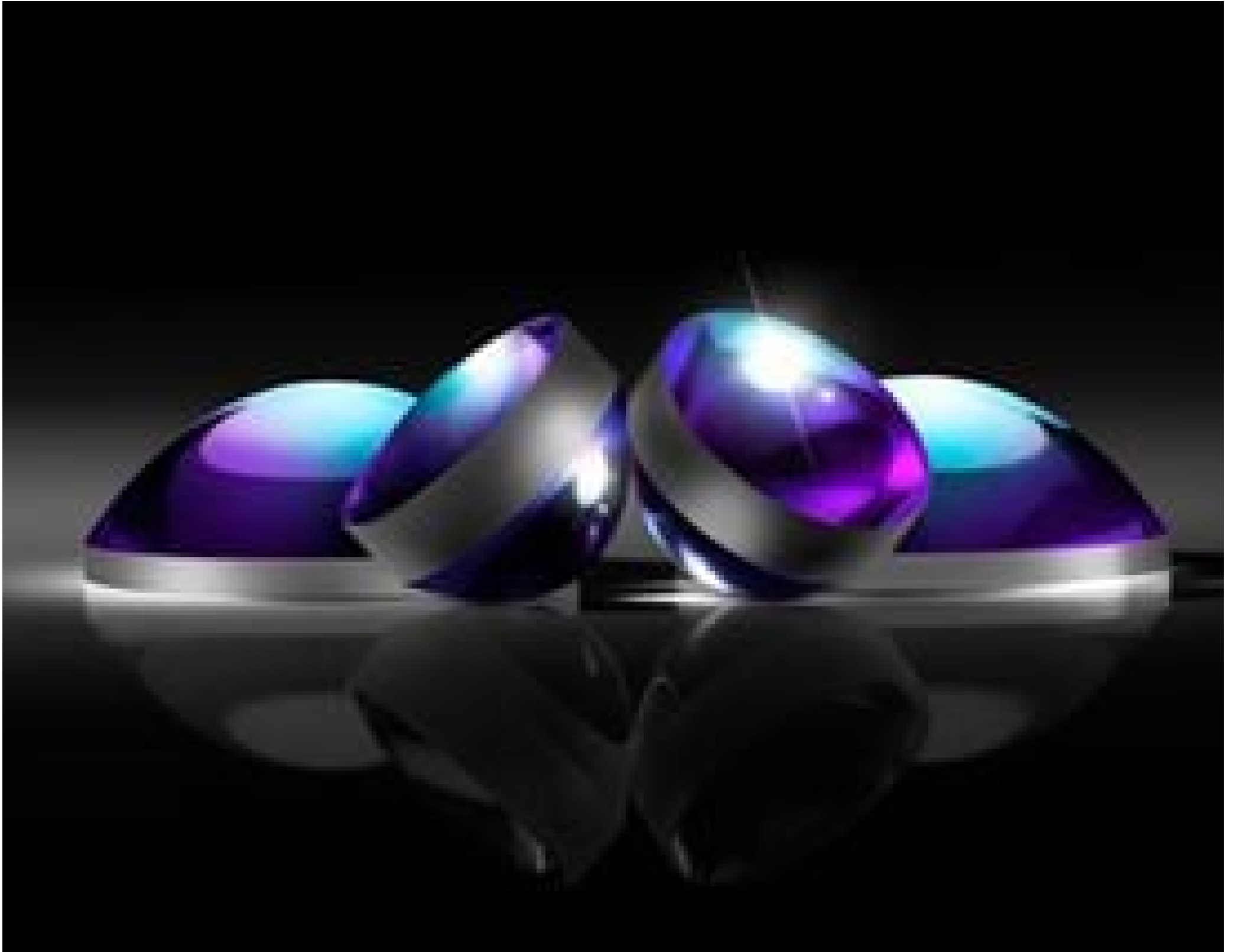
TECHSPEC® Calcium Fluoride (CaF 2 ) Aspheric Lenses