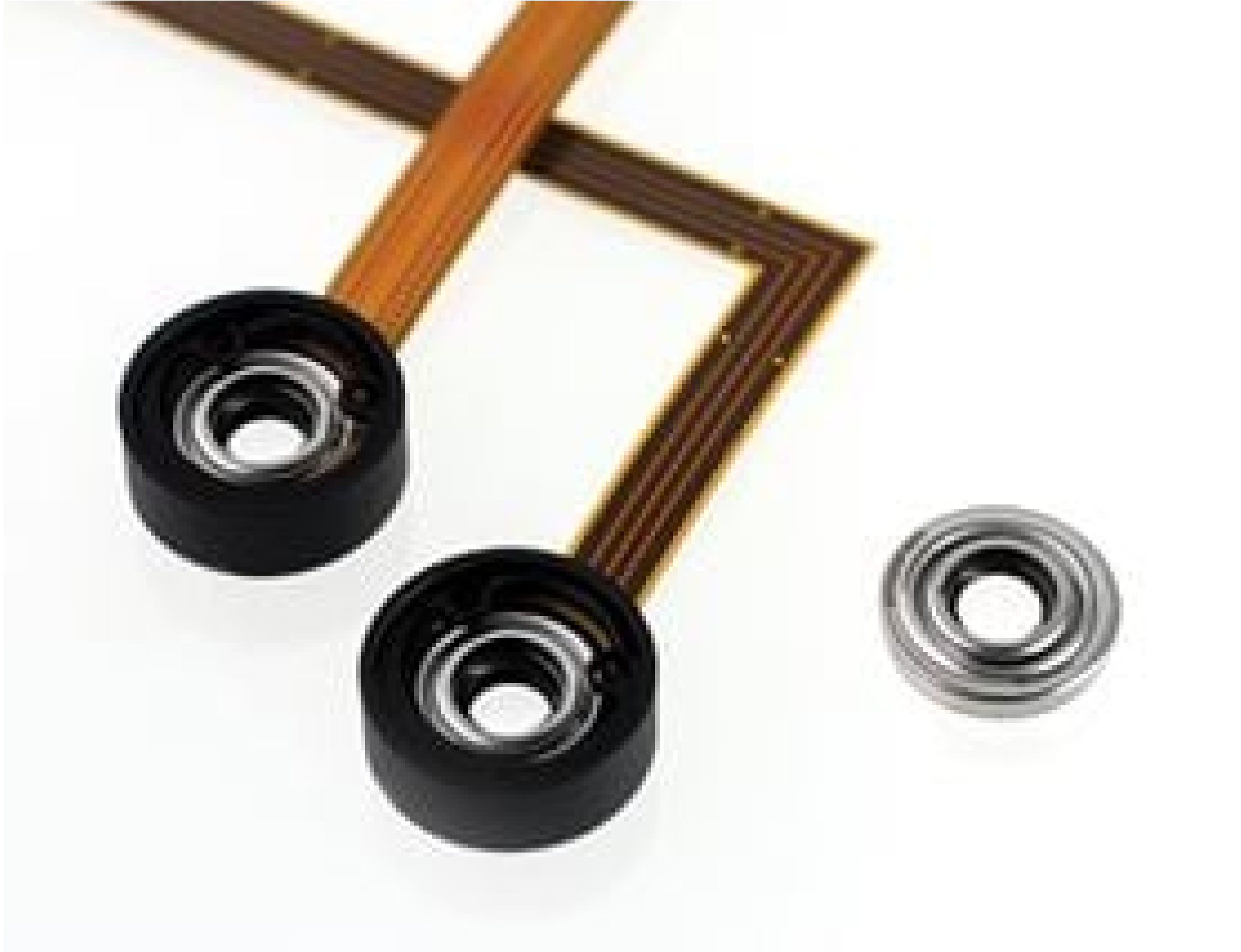
Corning® Varioptic® Variable Focus Liquid Lenses