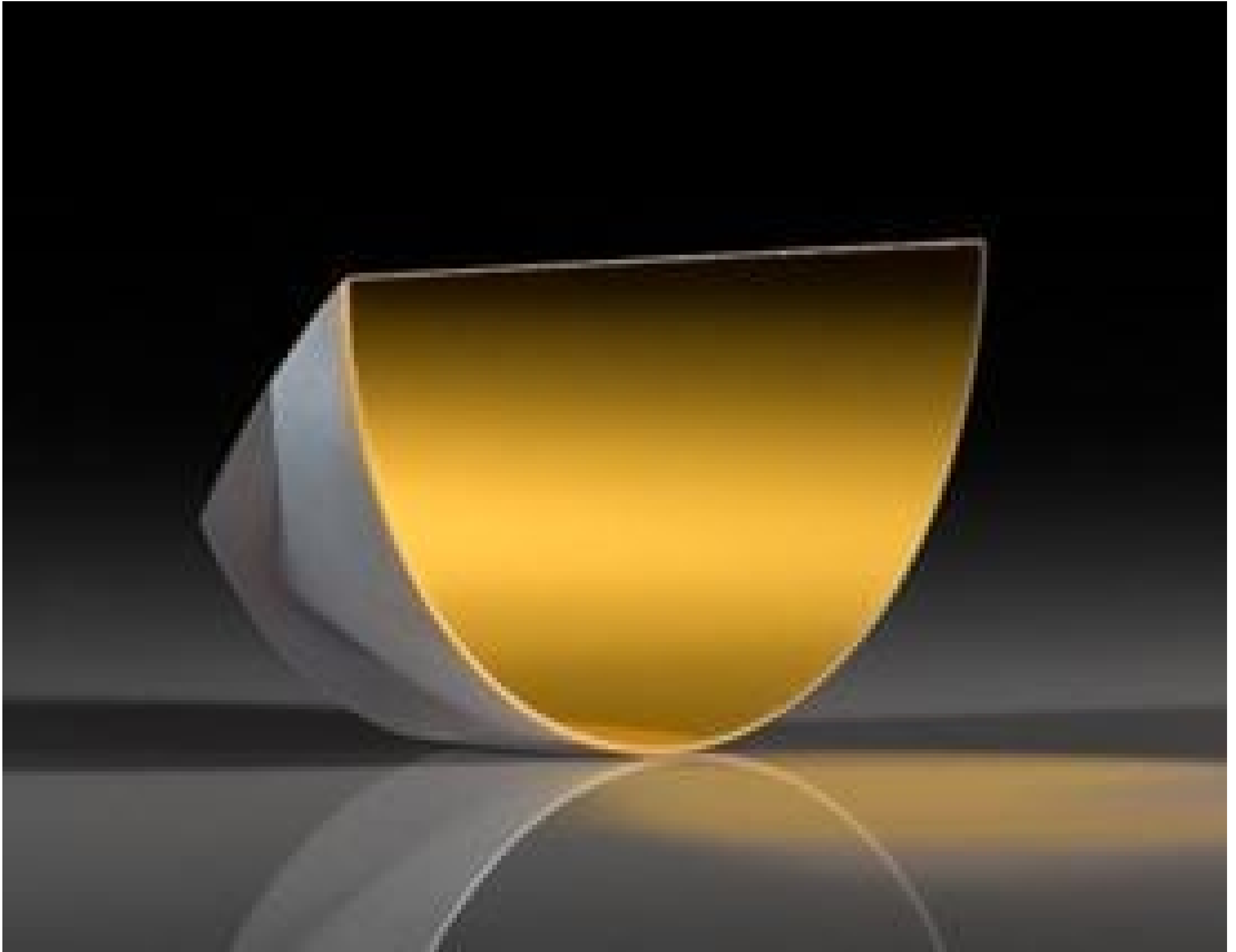
25.4mm Enhanced Protected Gold \lambda/10 D-Shaped Pickoff Mirror, #36-136